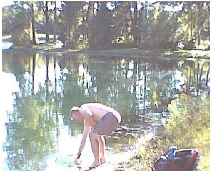
Last one in... "Is it really warm?"