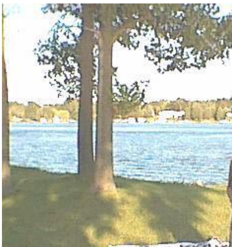
Backwaters of Wixom Lake. Beautiful on surface...