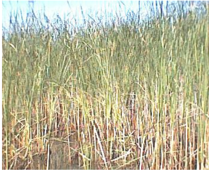
Lake Hemlock in Daylight

and follow the bottom. The lake contains bigger fish, but only the tiny ones were out that night. No wrecks of any kind were seen. Val topped off the dive by furnishing refreshments after we crawled out; good president!