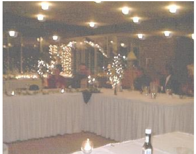
The Banquet Tables