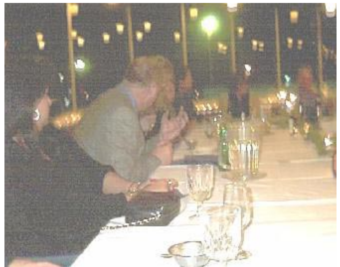
"What did I order?"