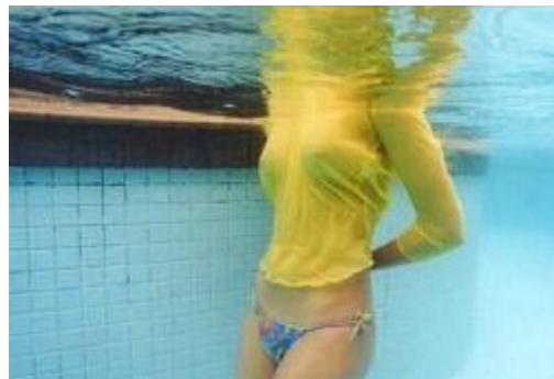
Clear, comfortably warm water; sometimes a bit nippy....

As if there wasn't enough club activity this week, remember the club pool swim at Garber HS on Sun the 16 th (day after banquet) from 4-6. Last month's had a good turnout, and your editor tried out his new not-made-for-underwater camera.