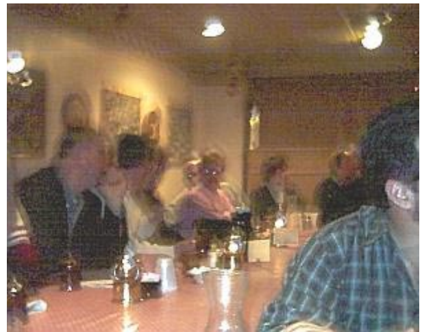
'03 Banquet Scene; Krzysiak's Restaurant