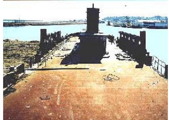
The ‘Straits of Mackinac’; dry-docked in Kewaunee, WI