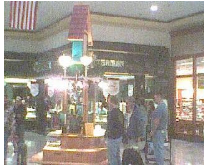
Activity at main mall intersection

And here they are! As promised! 50 (count 'em) beautiful swimsuit subjects frolicking on the beach, cavorting in the sand, soaking up the sun!