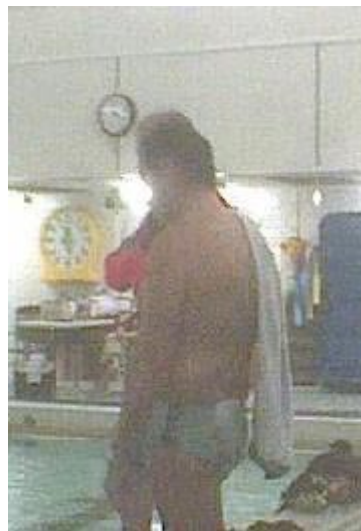
Swimsuit of the year