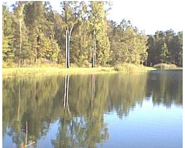
Beautiful, pristine King's Lake, site of the '04 underwater pumpkin carve. Calm waters, 15 ft avg depth, relatively warm. You'll want to bring your camera with your knife.