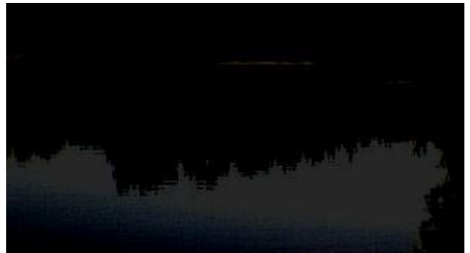
previous night dive; King's Lake