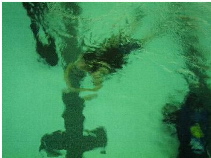
So many divers down, we should've had a dive flag

The SCOOP hasn't heard anything official yet, but with this much activity in February, you can probably count on a March swim also. Again, this will be at the Bay City YWCA starting at 3 pm. Beat the rush.