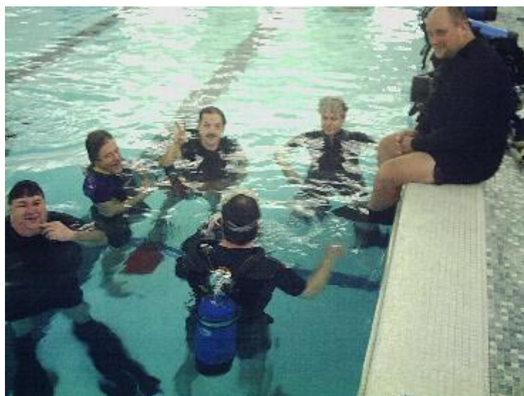
And the traditional group activity; moxie(Irish word)