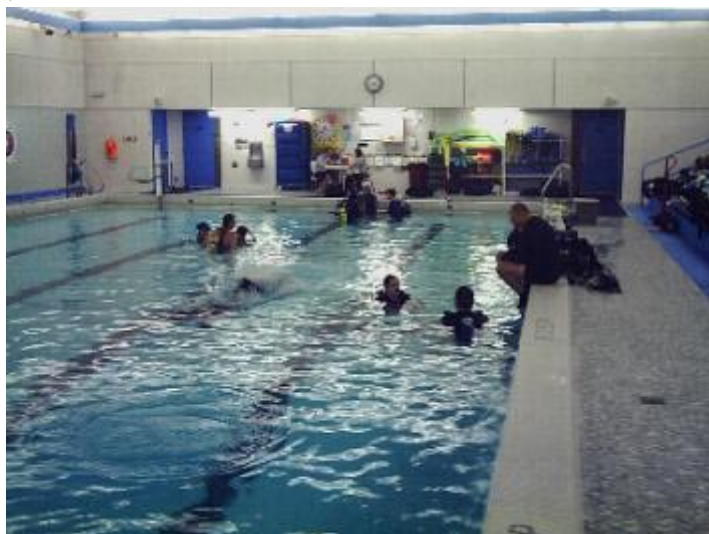
Good attendance; lots of activity

February's pool swim had a good turnout, including new people in attendance. Some old people also... This is leisurely, comfortable diving; a chance to socialize with your club and make sure your gear still works at the same time.