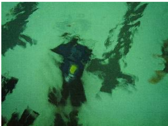
... Bottom time; almost asleep

The SCOOP hasn't heard anything official yet, but with this much activity in February, you can probably count on a March swim also. Again, this will be at the Bay City YWCA starting at 3 pm. Beat the rush.