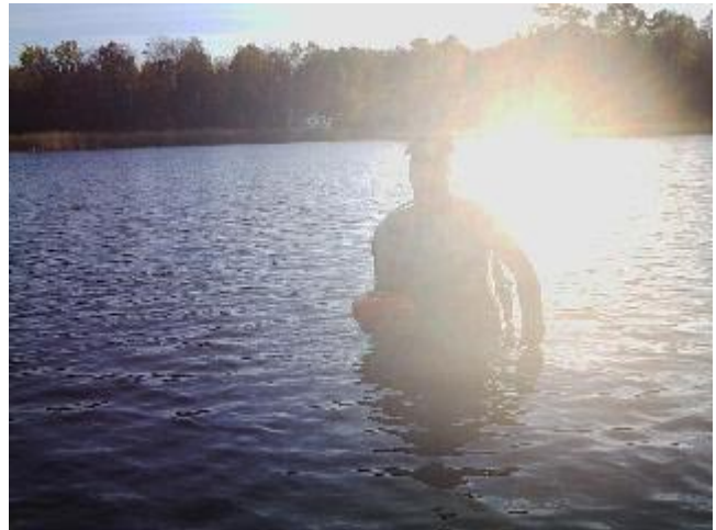
Beautiful sunny day...