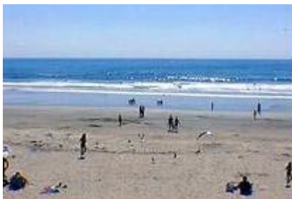
Participants and observers at site