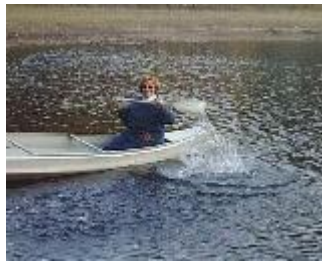
Pumpkin Carve Judge