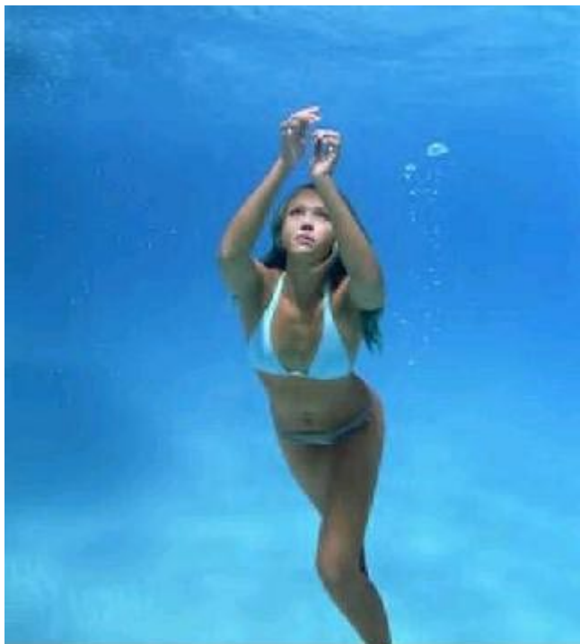
Jessica Alba; "Into The Blue"

The Scoop does not usually cover movies, but the recent "Into The Blue" deserves some acknowledgement. The story is loosely about some scuba divers discovering a sunken plane, unfortunately belonging to drug dealers... To prepare for her part, star Jessica Alba started training 6 months prior to filming(as stated by the publicists), and learned free diving. She is apparently able to free dive to 60', and hold her breath for 1 1/2 mins. This is quite an accomplishment, and the Scoop salutes her.