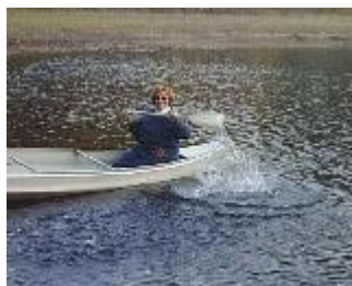
Pumpkin Carve Judge