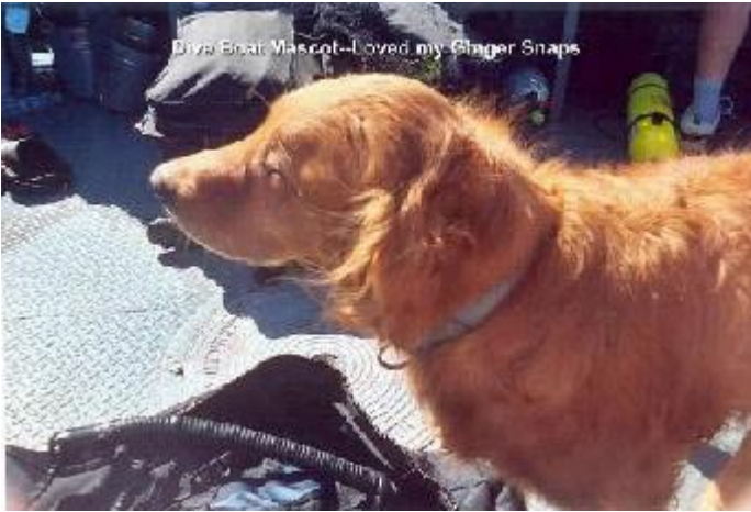
GingerSnap-eating mascot Awwwww....