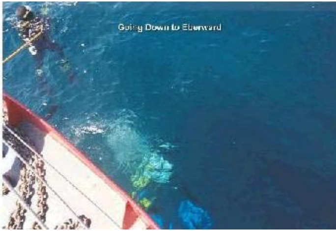
Down on Eberward