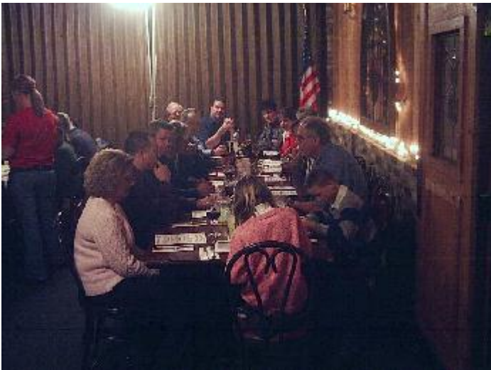
Main table, but note where the waitress is taking orders first...