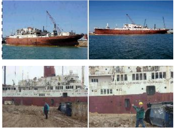
The Texas Clipper's last days

Originally planned for Mar'07, the Texas State Park System has scuttled 'The Texas Clipper' off San Padre Island as an artificial reef.