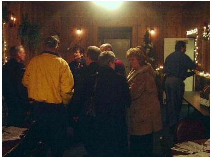
To close, Best of Holidays until next year!