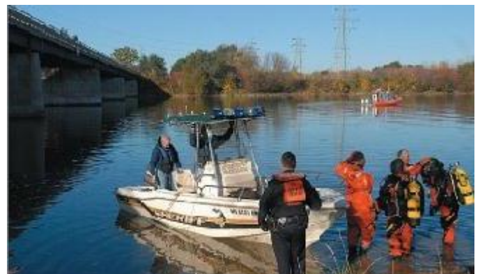
Dive Team activity last month- search near the Center St Bridge

The Texas Clipper begins a new day as an artificial reef; 11-17-07 (Ed Note: to Dale P.; the Scoop knows it's only a matter of time till you're on it, if you haven't already. Please send back story)