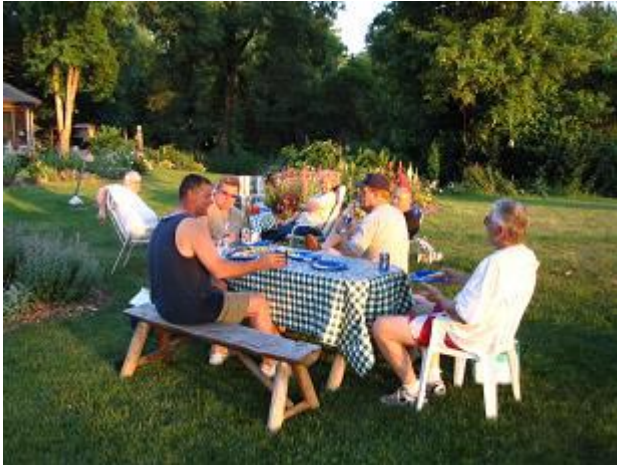
Leisurely meal; "any tuna salad left?"