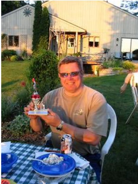
Winner! Underwater Bowling Award Recipient