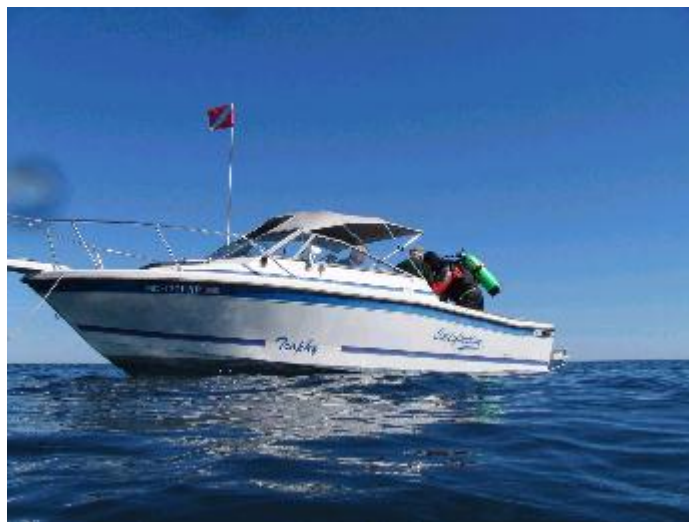
Tim's 'Satisfaction'; (no argument here...)

A wonderful time was had by all and, as always, I'm ready to go diving again!" -Tony P.-