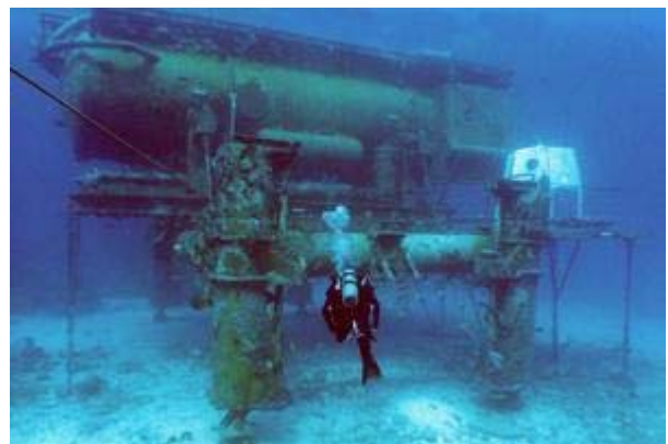
Aquarius Reef Base; undersea lab

For nine days, divers lived in this undersea lab near Key Largo, FL. The NOAA mission was to study corals and marine life. Until Sept 26, live viewing was offered on their internet site.