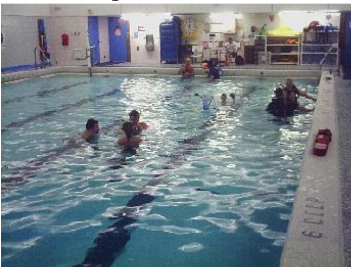
Didn't happen March pool swim