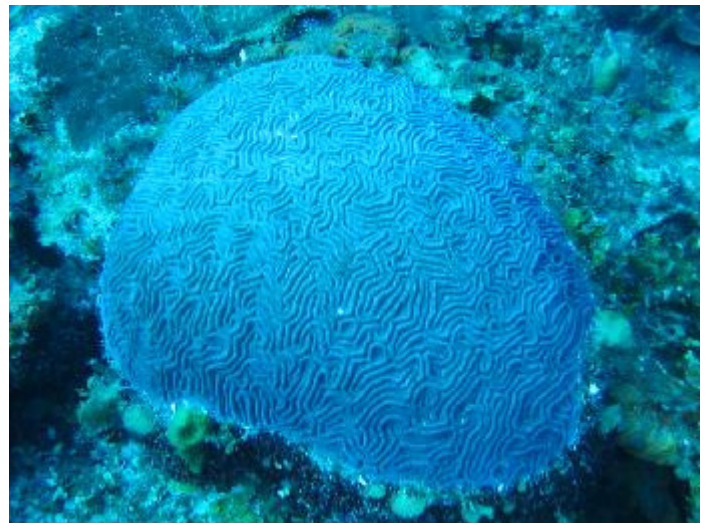
Jamaican Brain Coral