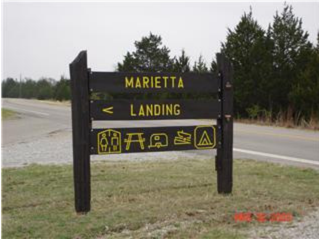
OK dive site