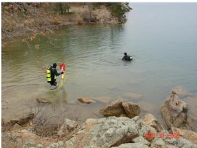
Entry point; the cove