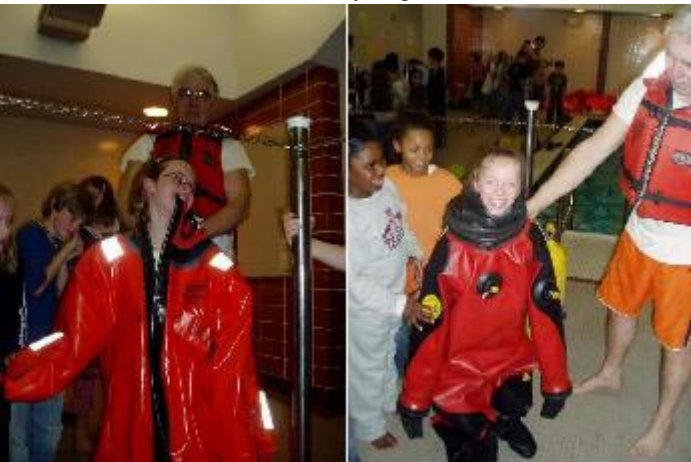
Fashionable Gumby and dry suit exhibit