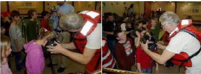
“Breathe; count to 5... Did you get air?”