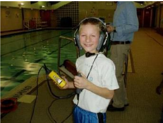
“Hey; I can hear them!”