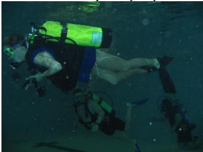
Deep water activity