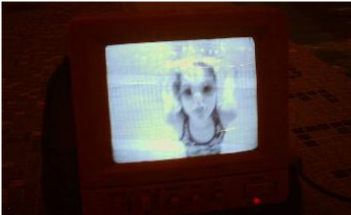
LE caught in cam