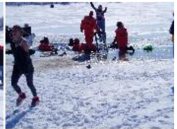
Jump, climb out, run for towel...