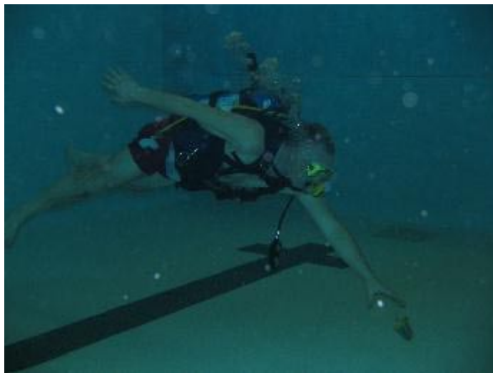
Don's turn to chase rocket