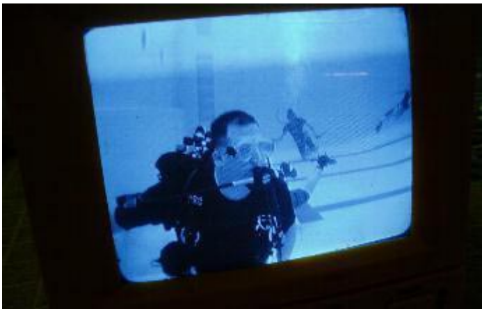
Candid cam; u/w version