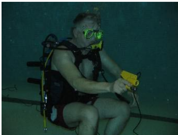
-working the u/w radar for SCUBA speeders