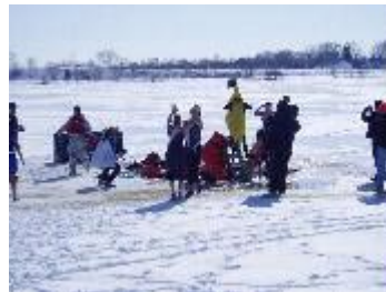
The banana jumped...