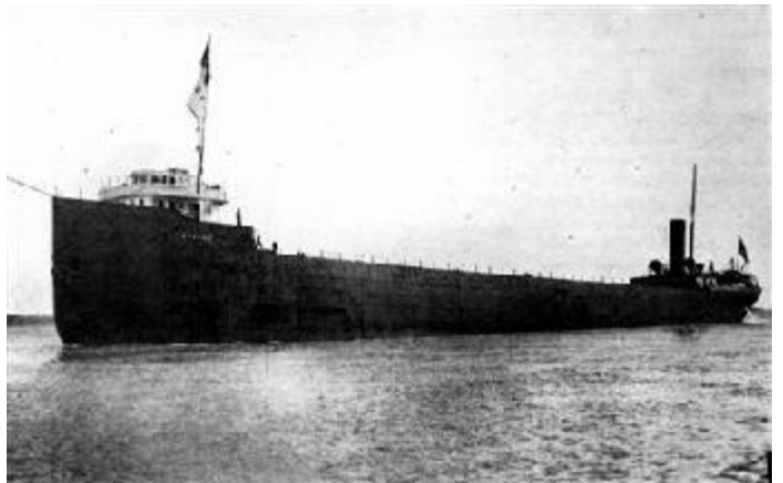
Ore carrier Cyprus; down in 1907

On a more honest story, the wreckage of the ore carrier Cyprus has recently been discovered 460 ft deep in Lake Superior. It sank on only its second voyage, Oct 11 1907, in a moderate gale that apparently didn't bother other ships. Some suspect water came in through new hatch covers that had flaws. Further, the ship was found about 10 miles from where the sole survivor stated it went down.