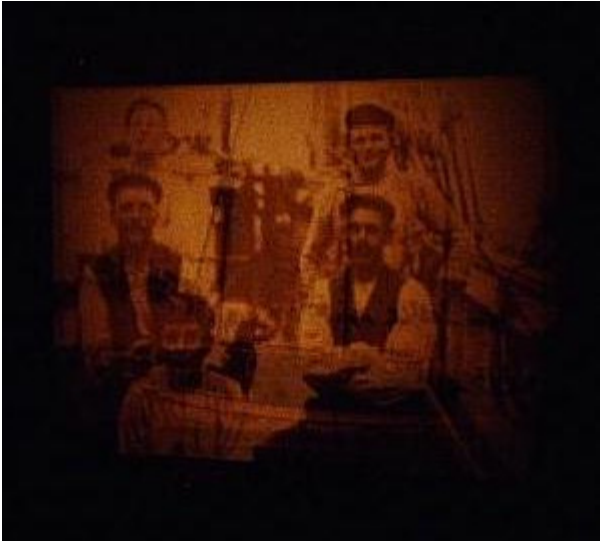
slide; Bradley crew