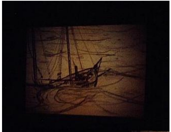
slide; Schooner Bradley