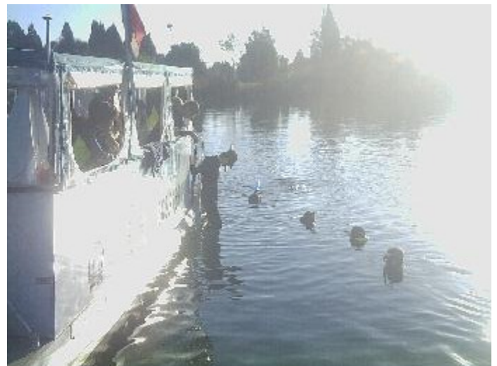
Divers in; Manatees below?

Seeing no other dive report on my clipboard, let me take some space to relate my manatee dive. I spent the holidays in Florida with my daughter’s family, and she signed us up to pet the manatees at Crystal River. The dive shop furnished wet suits, fins, mask & snorkel, and placed us on a pontoon boat in a group of 10. We were out before light, but we beat a lot of other boats heading for the same area. The river might’ve been around 10’ deep, reasonably clear, and 72deg. The dive master gave us a lot of rules before we got in; Florida is serious about not bothering the animals, and threatens with heavy fines. But the manatees do like people and they did come over to us. I might’ve been the last one they came to. They did suddenly appear up against you, and they did roll over to get their bellies scratched. One pushed his face into my mask, and stared in at me! To finish off the dive, we went to the headwaters where you could see the water gushing up from springs. Really clear, with a lot of fish I’d only seen in an aquarium... -UrEd