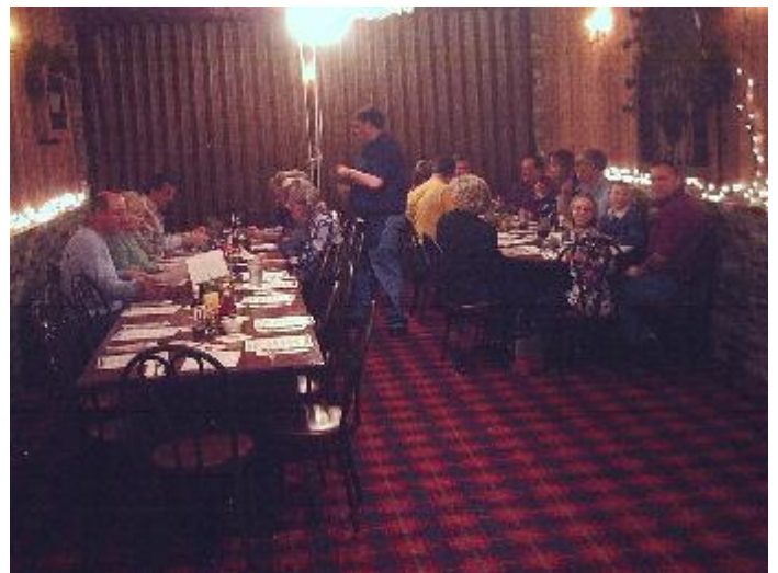
Finally; time to order the meal