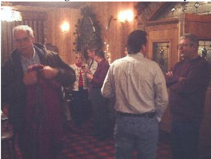
Members arriving at the Timbers