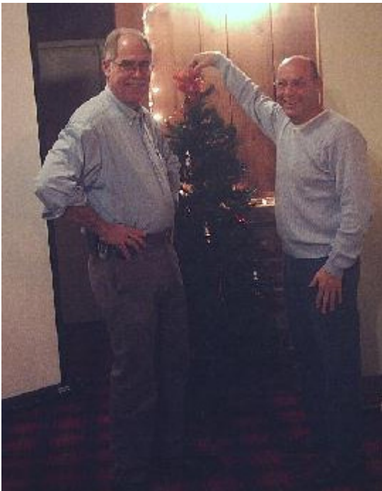
Christmas party revelers