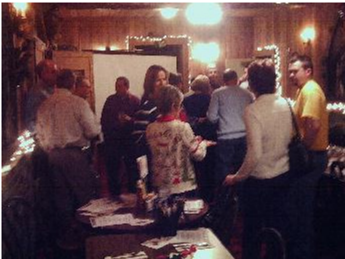
-soon becoming a crowd