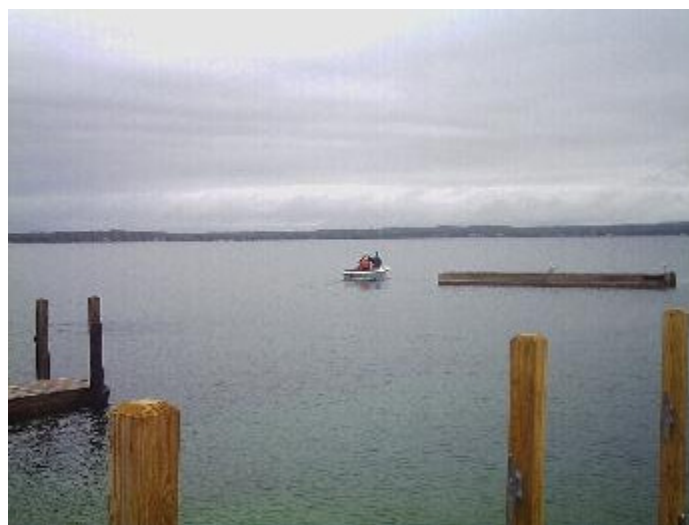
Out to find the Keuka...