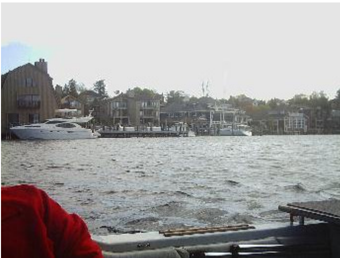
Searching for the Elizabeth