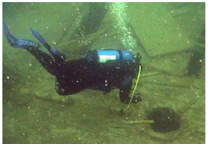
Diver on the deck of the Keuka