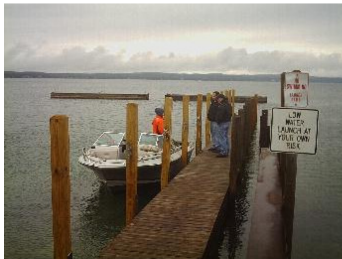
First group about to leave