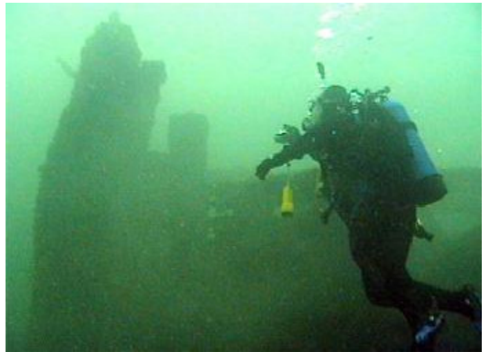
Unk diver on the Keuka