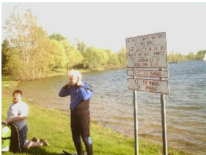
Ah, that pesky 'No Diving' sign...