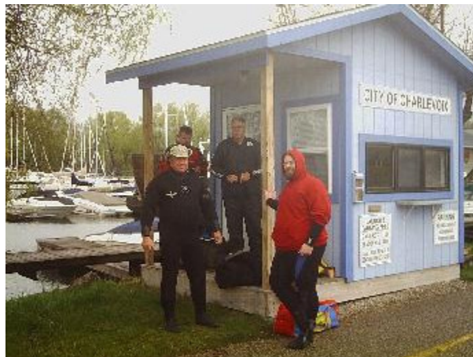
Changing room; front porch of Port Authority

Lake Charlevoix water is really clear, and in spite of the cold it was a good dive. The majority of the group also dove on Sunday; bright clear sunny day and some good u/w photos were gotten. An attempt was made to dive on the 'Elizabeth' in an adjoining lake, but it could not be found. The Elizabeth is a cruiser intentionally sunk by the local authorities as a training wreck.