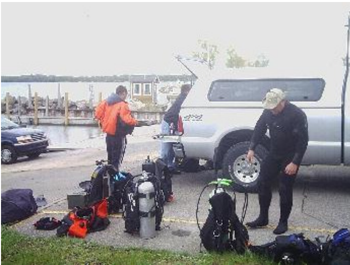
Second group preparing gear