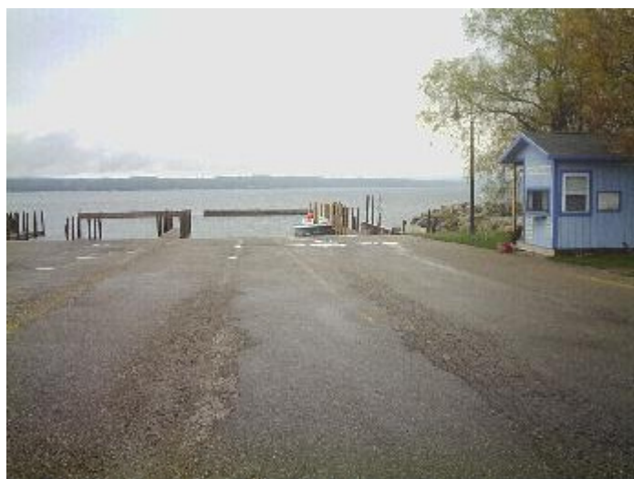
Charlevoix Marina, Saturday morning