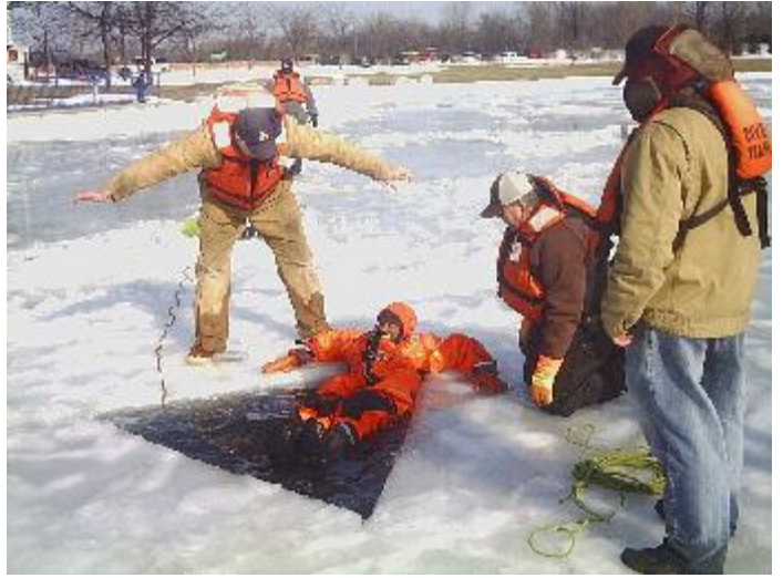
SAFE! Umpire Sommers calling the reporter sliding in...

SUE/DiveTeam members also participated in the Special Olympics Annual Polar Plunge