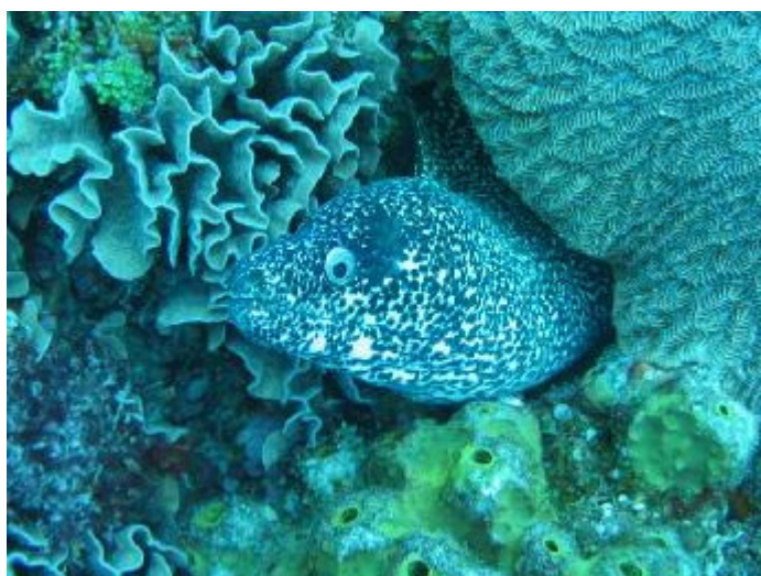
This one too.... Good picture!