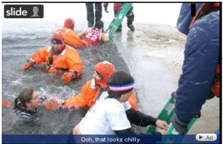
Ooh, that looks chilly