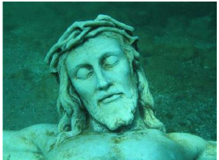
Crucifix statue; diver's memorial in Lake Petoskey