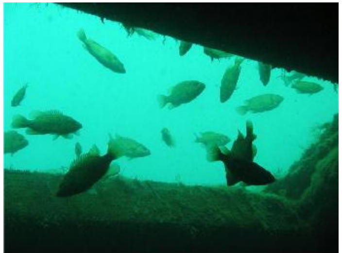
Life in the Keuka