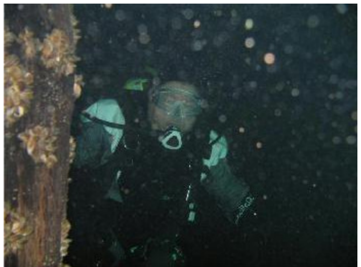
Hanging alongside the Keuka?