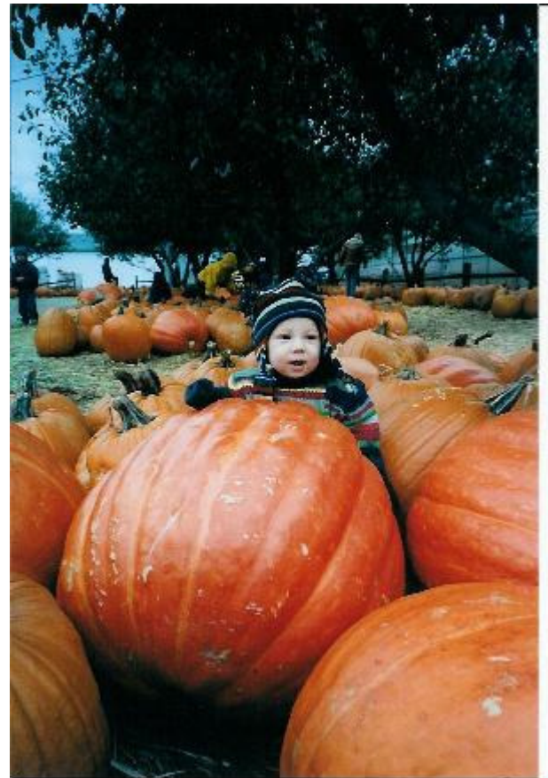
Wait; that's the one I was going to take...

Occurring at a new location, this year's club carve will be held at 'Lake of Dreams' campground; west on M46 from Merrill, south on Fenmore (map below). Unless notified otherwise, plan on 3:00 on Sat the 10 th . The owner has really extended a welcome to us on this; it should be a fun event. At least a year's membership for 1 st place; possibly other prizes. Plan your art ahead!