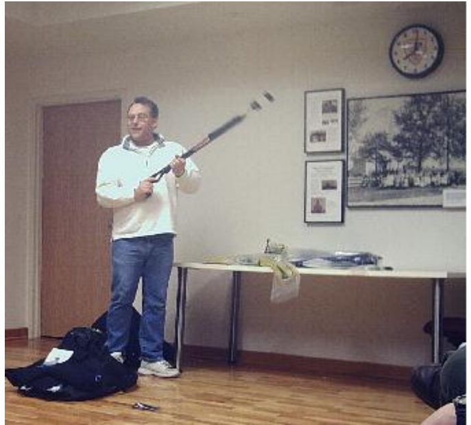
- to spear gun

And, remember that the April meeting will be holding a parking lot swap during VIPs. Bring those items out of the garage that have been gathering dust, and see what valuables the other folks have brought. The April (and May) meeting will be held at Thomas Twp Fire Station #1, on Miller just north of Gratiot.