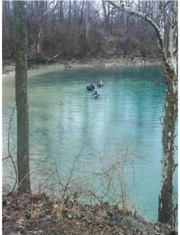
Nice picture! (doesn't look cold...)