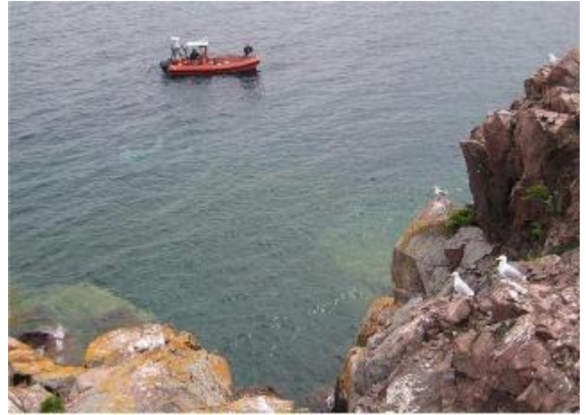
Zodiac island taxi