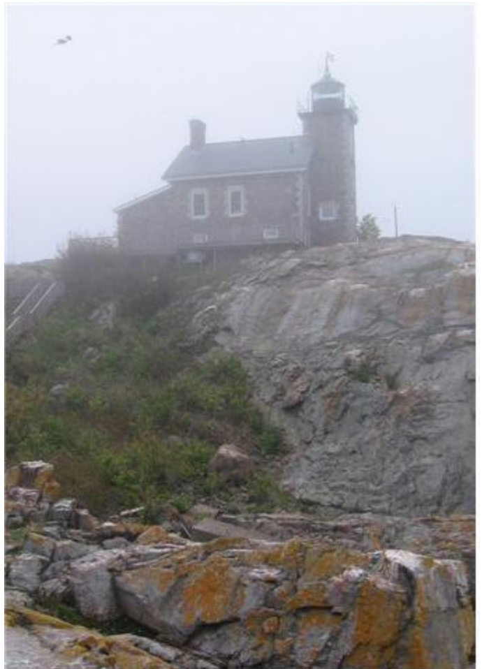
Lighthouse on Granite Island; privately owned off Marquette