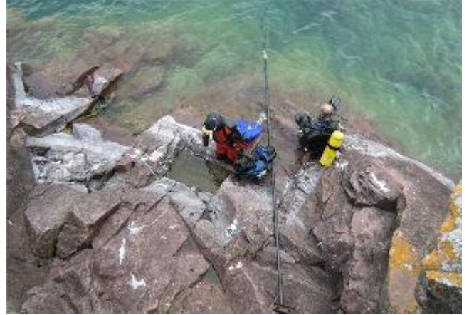
Larry and Dave remove gear on the granite "beach" after the first dive. The water pipe is between them and heads out into the lake.