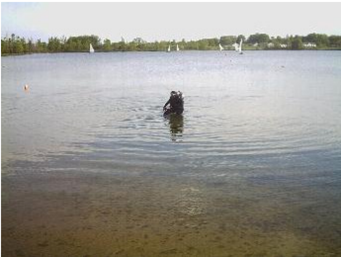
Chris; first in! Note heavy grass in forefront; jug marker on left (check out cute blonde in #3 boat)