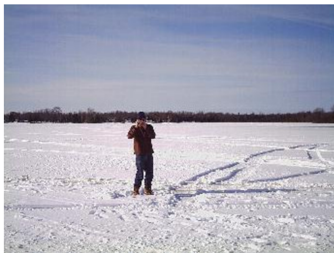
Ice coverage by noted photojournalist