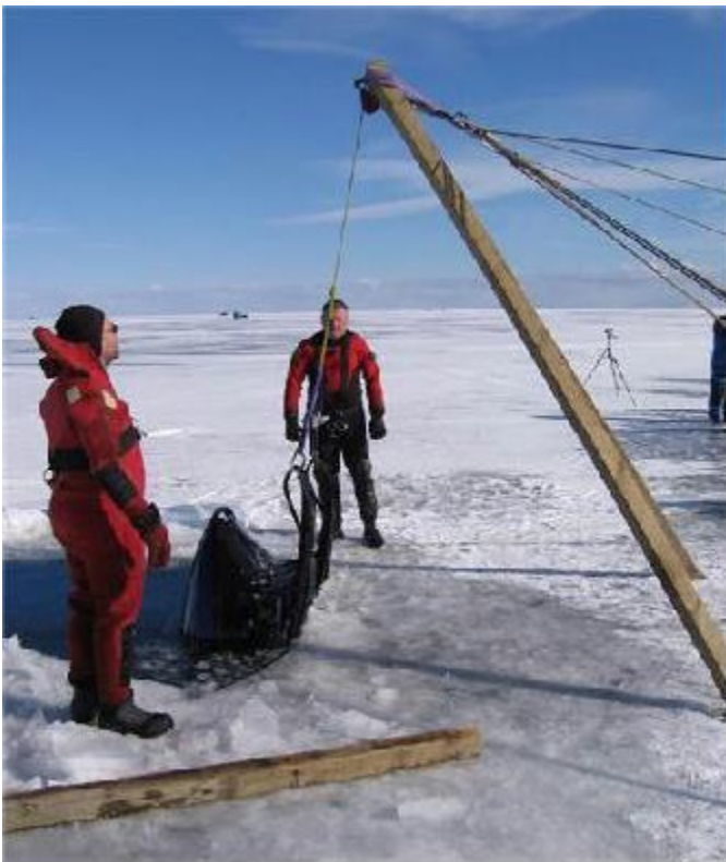
-and no limit on these...