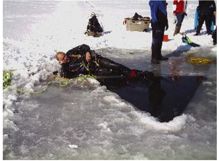
Almost forgot; Leisure Suit Larry...