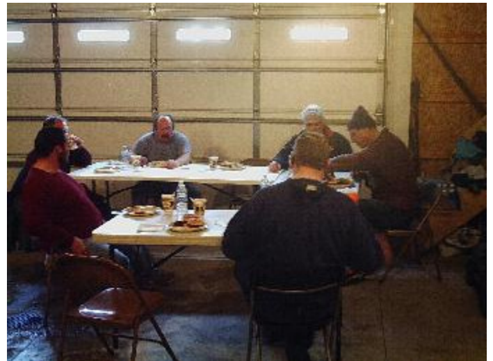
Great ending to a great dive; food and conversation