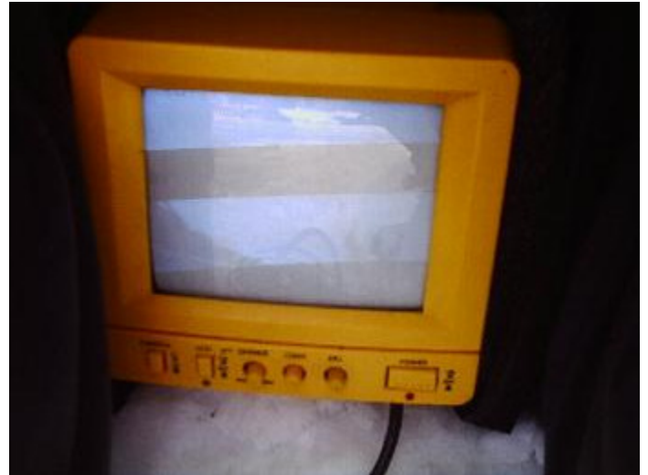
Look close, past the reflections- Mike under the ice...