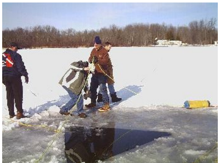
Laying out the safety lines.