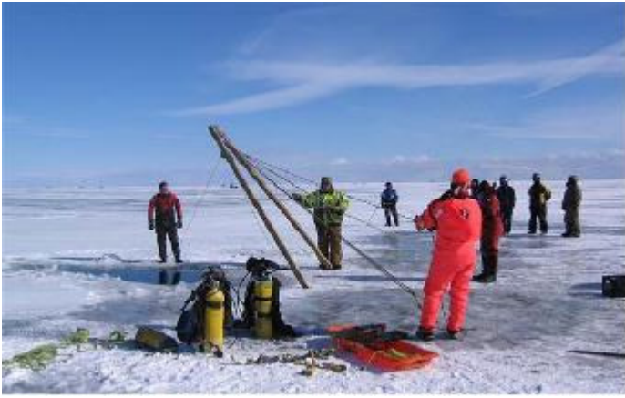
Well, trolling didn't work...

There's never a better audience than kids!-