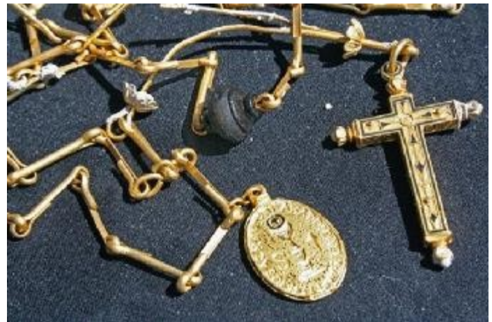
Ancient gold chain necklace found off Florida Keys