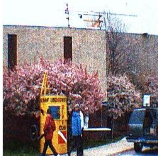
SUE Tank set up at Fashion Square Mall '02

Ed's 2¢: Also brought up was the use this summer of our club's portable dive tank. Would this be something to set up at the pig gig? Any readers have another festival we might set it up at? It looks good; do we even need water in it for show?