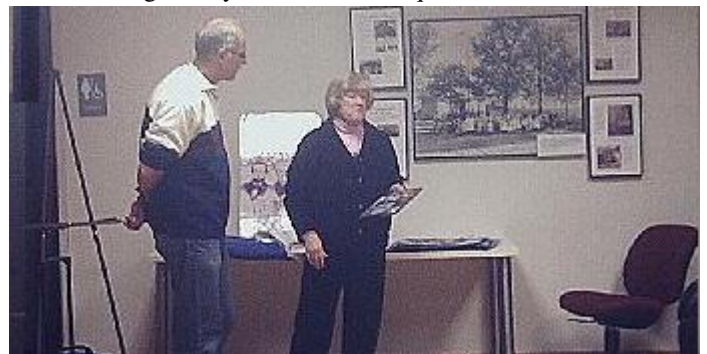
An early question...