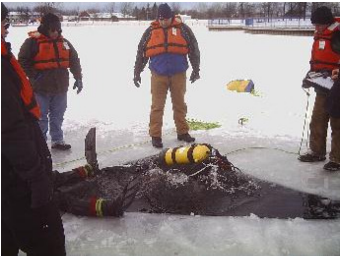
Garner rolling in...