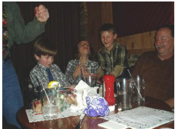
Not a party without kids...