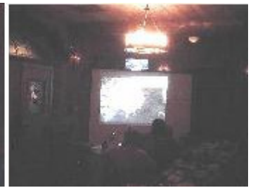
Munising rock

-Appetizers were provided by the 'Timbers'; and consumed during the presentations. Just right for the fine dinners to follow. No photographs during the meal were allowed. Conversations continued with the meals; then M.C. Piazza took the floor for the drawings.