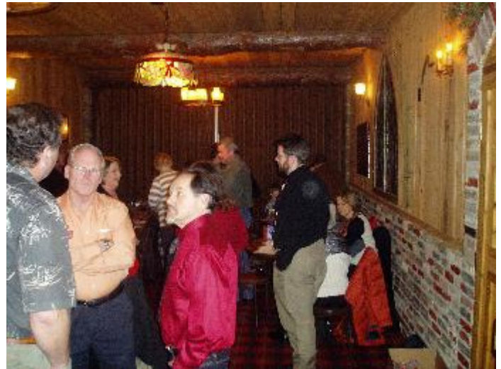
Nostalgic catching up

-Appetizers were provided by the 'Timbers'; and consumed during the presentations. Just right for the fine dinners to follow. No photographs during the meal were allowed. Conversations continued with the meals; then M.C. Piazza took the floor for the drawings.