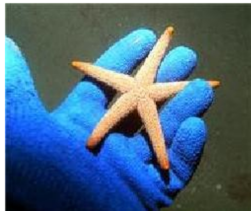
5 fingers; 5 arms... (Fabish)