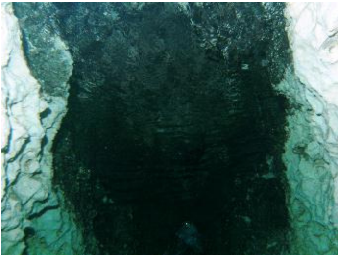
Into the depths...