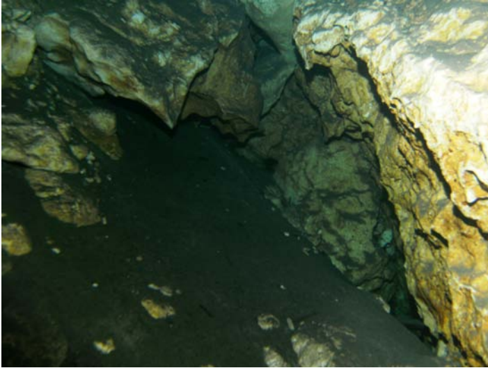
View from inside