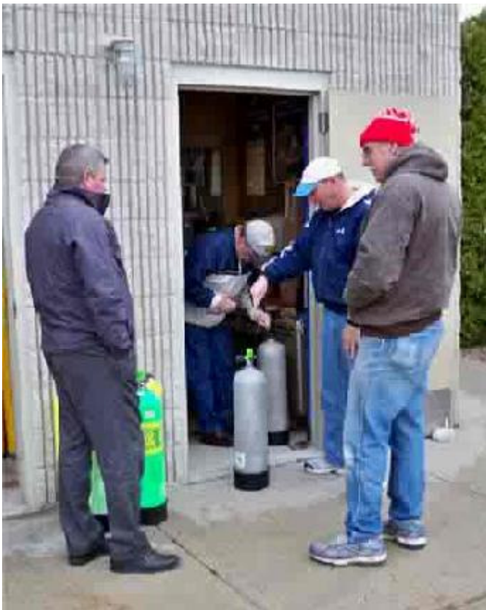
VIP center at FS#1; crew ready