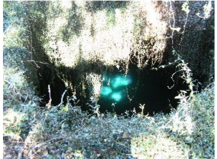
Looking down into the hole