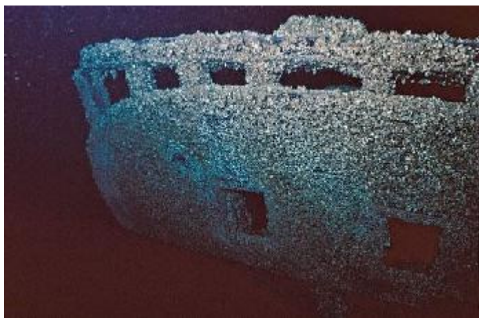
Stern of 60-foot sloop discovered last year in Lake Michigan