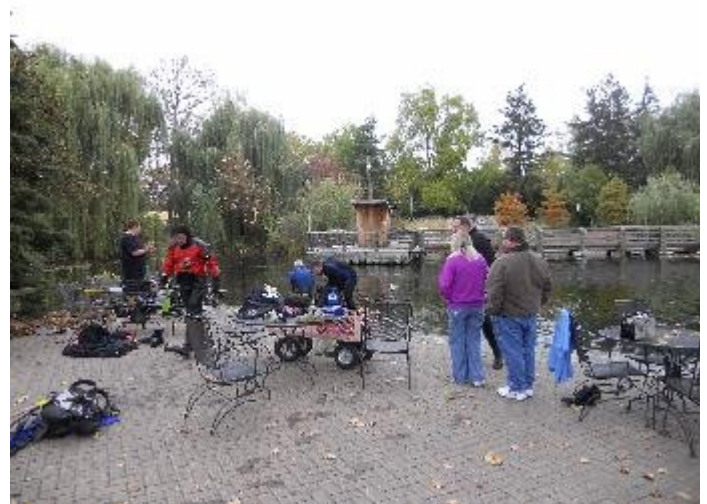
and, successful finish!