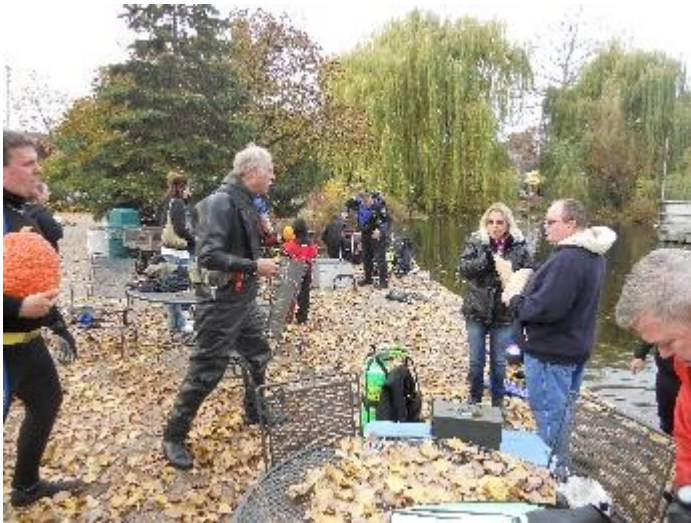
Excitement of fierce competition