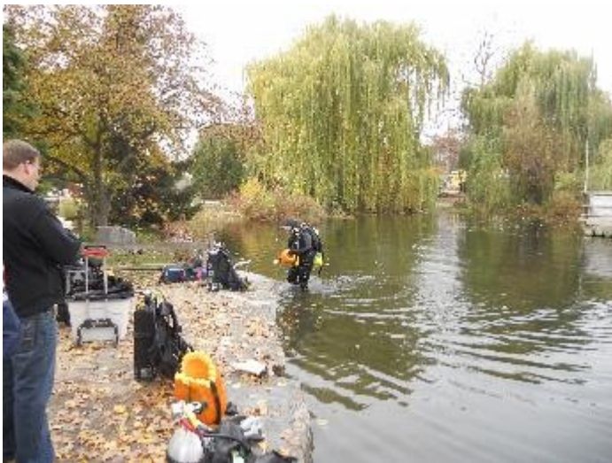
Scot T. crosses finish line