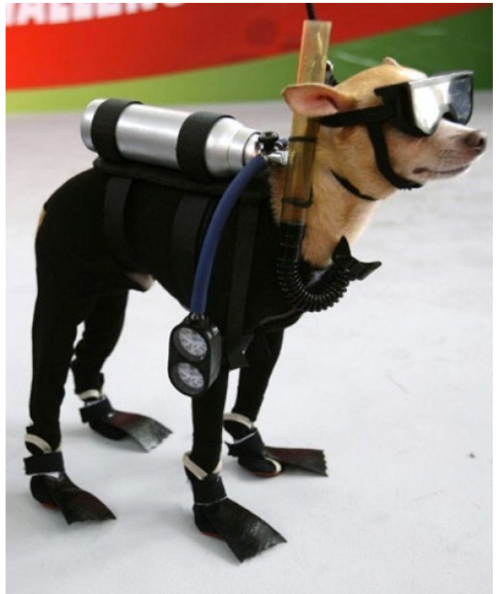
Cora the copy girl's pup, affectionately known as Chum...