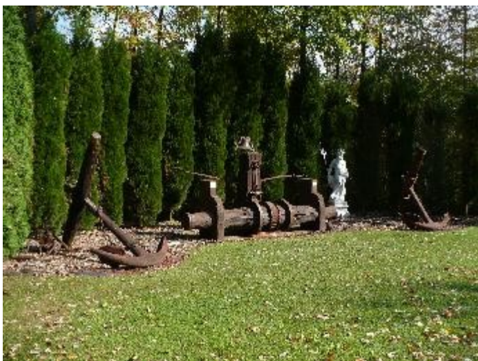
Dufty memorabilia- SUE members visit