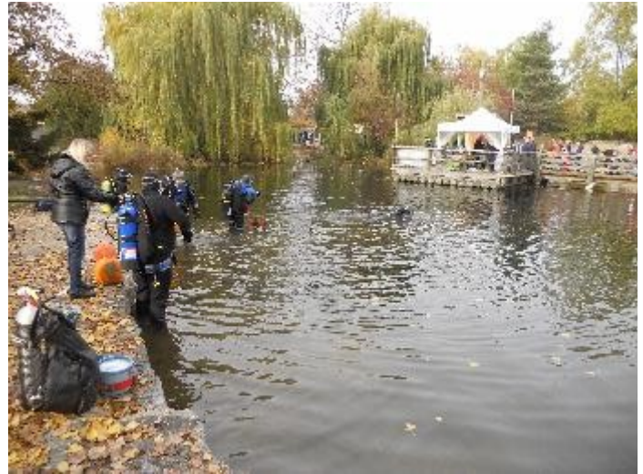
And they're off! (structure on right has the UW windows)