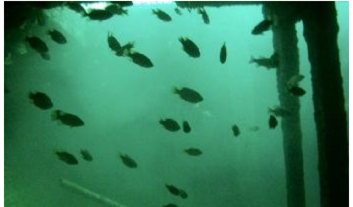
The Keuka offers plenty of fish to watch