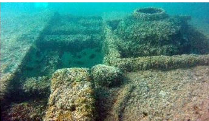
The Keuka deck is open near the bow. Lot of growth on the deck.

The weekend was wonderful, with great weather, a high in the mid 50's. The guys had fun diving and the girls enjoyed exploring Charlevoix. -Dave