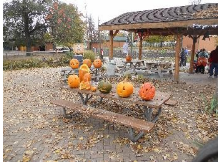
Superb collection! Winner in back corner (see cover)