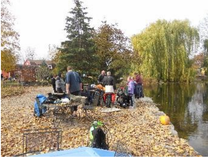
Assembly of Pumpkin Sculptors; note leaves on deck