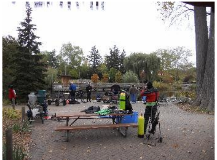
UW landscapers prepare to attack grass