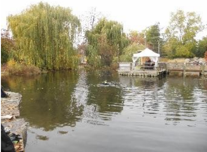
Last man to quit?