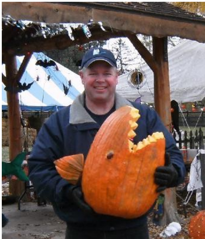
2011 UWPC winner! (almost lost his hand in there)