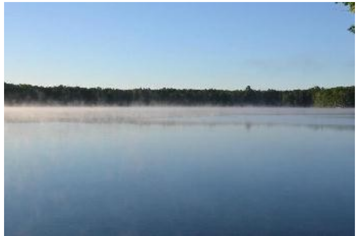
Shupac Lake (no motorized boats)