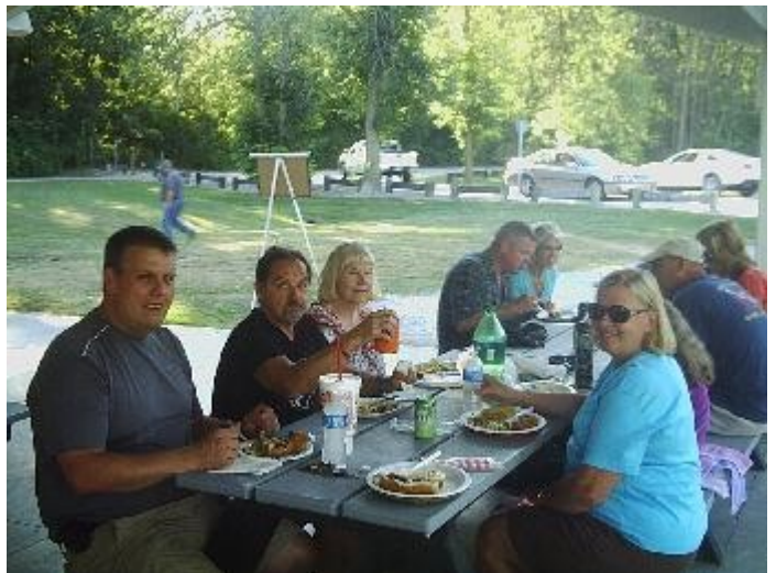
Meal interrupted by camera