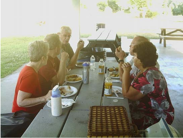
Well, not everyone lets a camera interfere