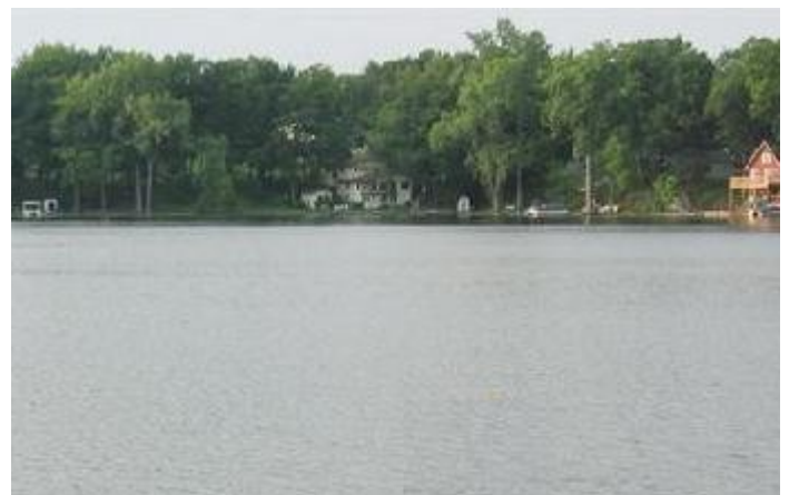
Peaceful, cool, Otter Lake...