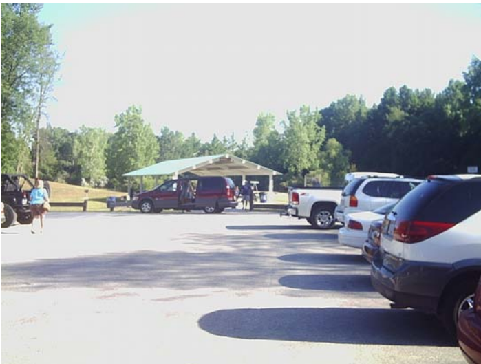
Great SUE 2012 Picnic Site