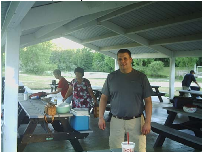
OK; time to clean up... and plan next year!