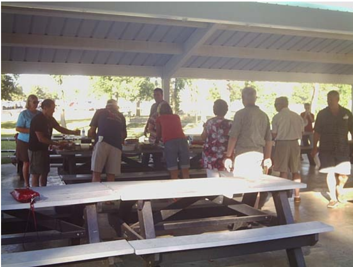
Food line begins!