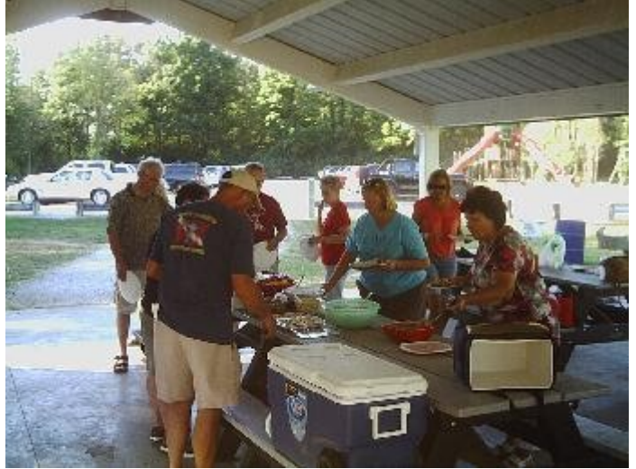
Not enough room on my plate...

This special follow-up on the 2012 Annual SUE picnic is intended for you folks who couldn't make it; we missed you. Fine family outing! Those of you that did attend are already aware of the great weather that day, the great food shared by guests, the featured club brats, and the camaraderie shared by members in deep philosophical discussions. Thanks to those helping!