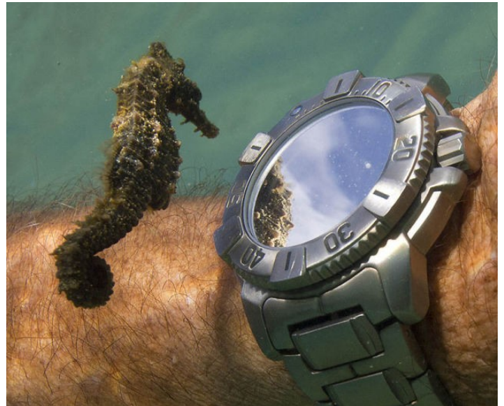
Just neat- Seahorse checking a diver's watch