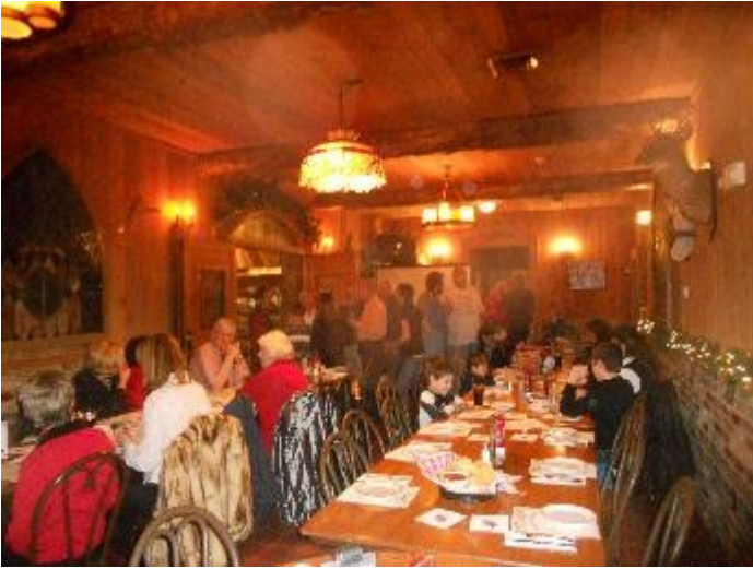
Party guests arriving at 'Timbers'; tables filling up