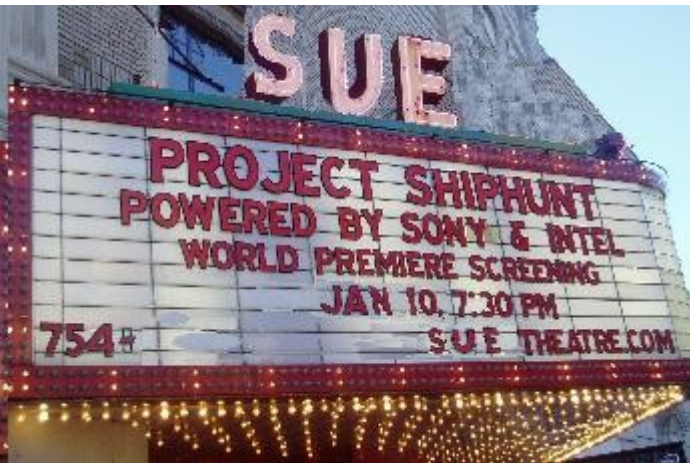
-coming this month to the SUE theatre!