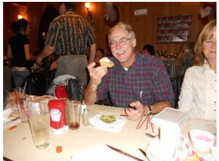
Last cupcake of the Christmas Party