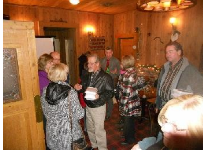
And then, farewells. AAGTWHBA