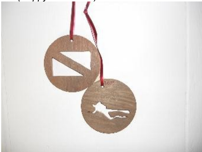
Special plaques presented to the SCOOP at party

also selected short subjects (Happy New Year!)