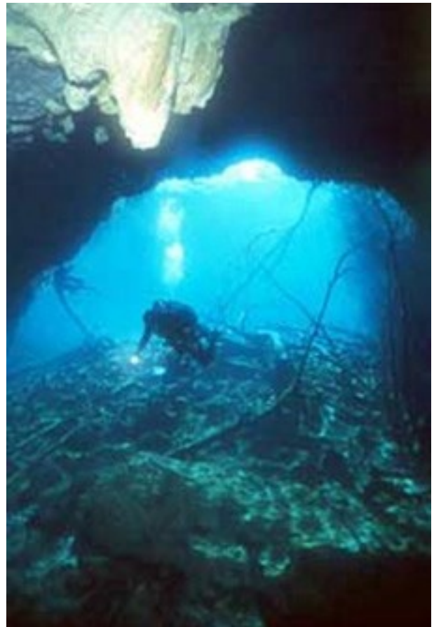
100' of vis!- Bonne Terre Mine

Bonne Terre Mine was worked from 1870 to 1961, then mining ceased. The waters at Bonne Terre are a constant 58° F -with no thermocline! The mine's air temp stays at a solid 62° F.