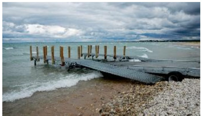
Unique boat launch; flatbed trailer + 2 docks?