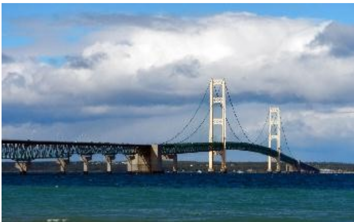
Green vehicle on left is Sommers on way north...