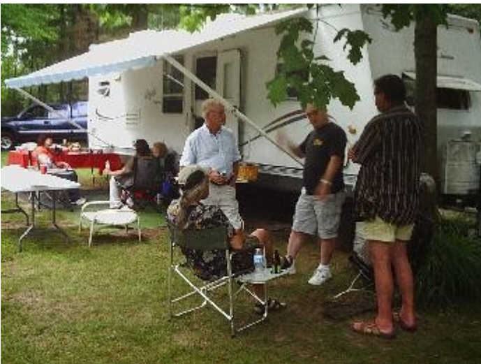
Rain subsides; guy stories at this end...