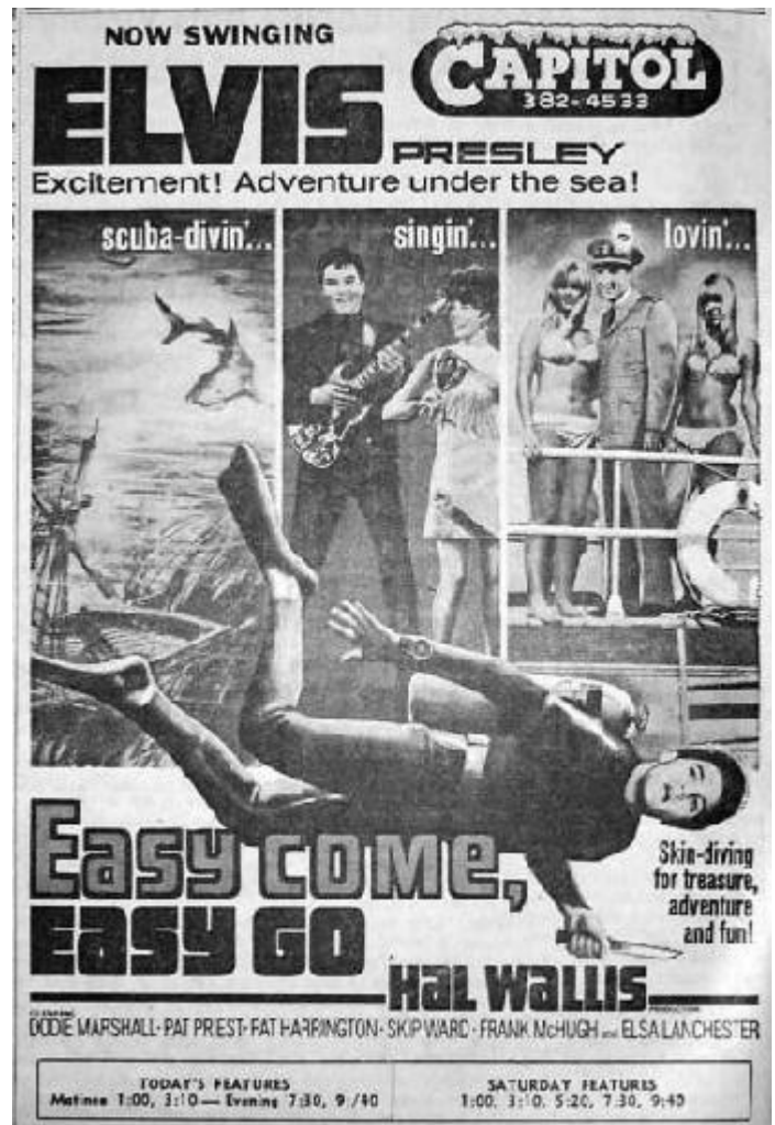
Elvis Presley; movie diver