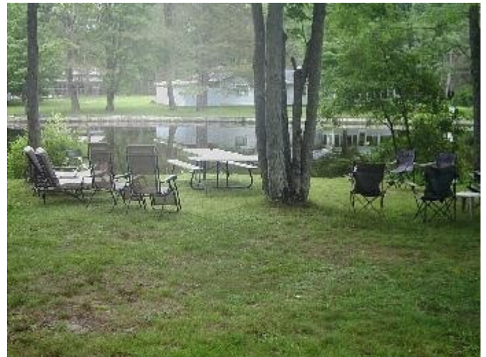
The chairs were set by the lake with care, Hoping the rain would not be there...