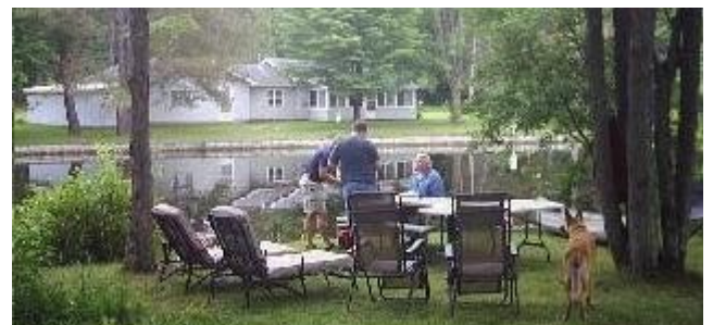
-Seating by Bob