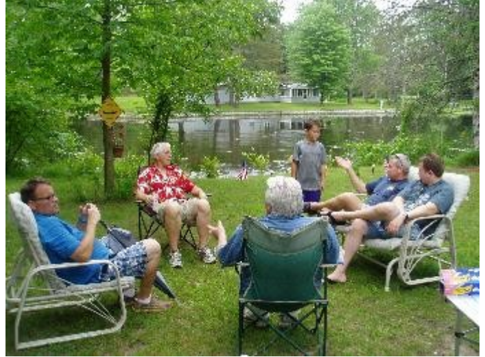
Almost business time-