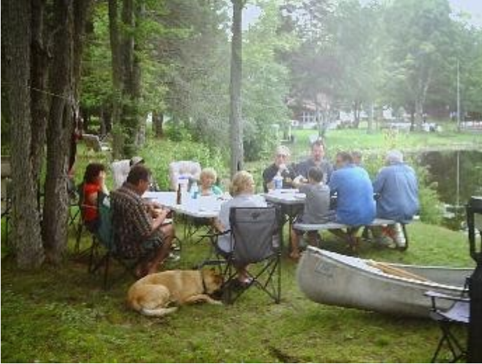
Aahh, relaxed; just before the rain...