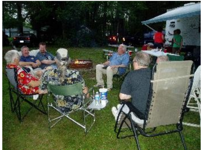
Sure; serious club business to finish the picnic!