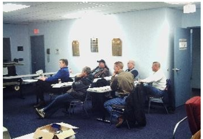
Split panoramic view of classroom