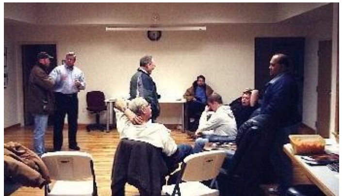
Downtime at meeting