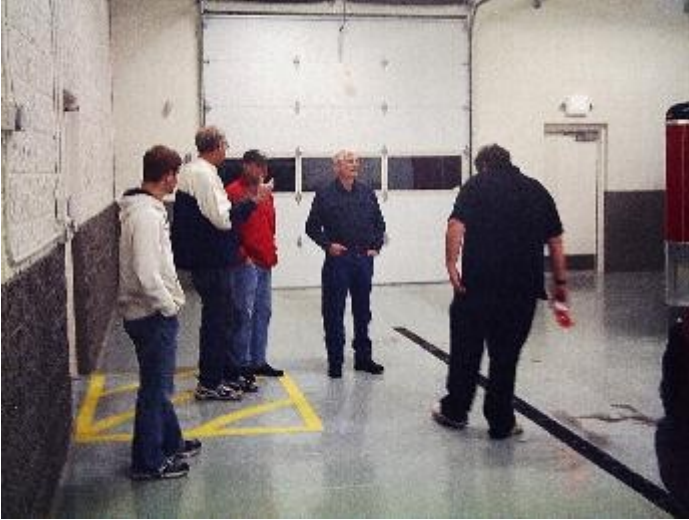
Tour of new bay at fire barn; SUE meeting site