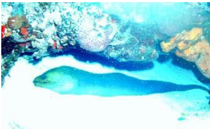
Find the- Moray