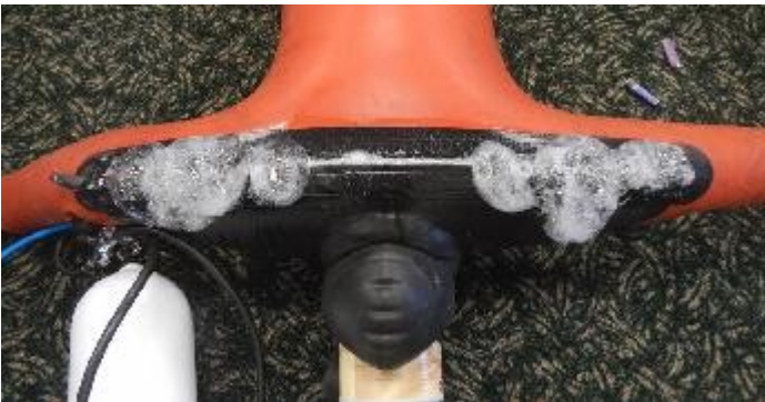
A zipper leaks badly after sprayed with a soapy solution. It will be replaced.