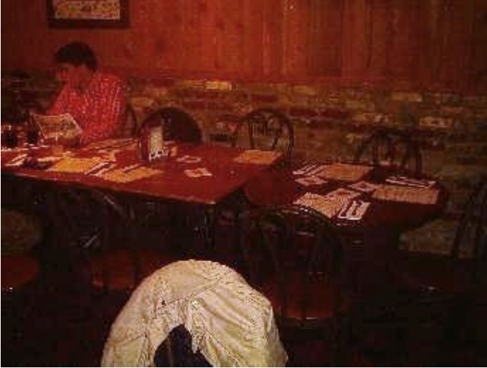
Yes; saved you a table!