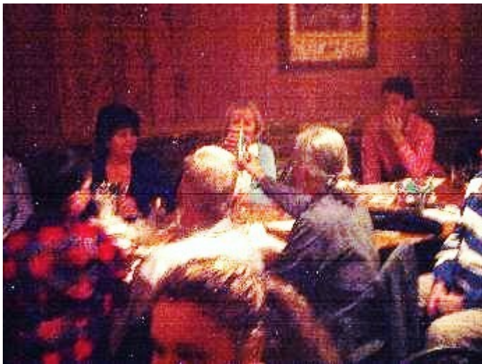
Even Val winning something?