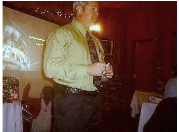
Gift raffle! Find those winning tickets!...