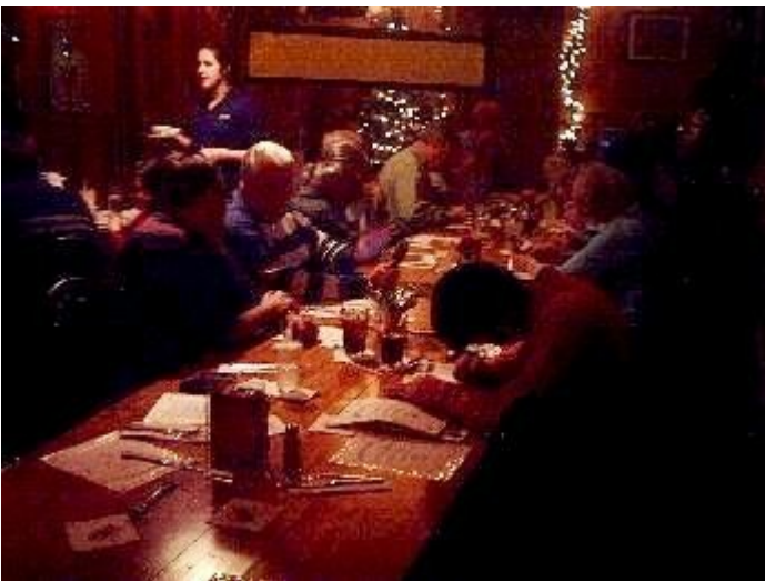
"Ready to order?"