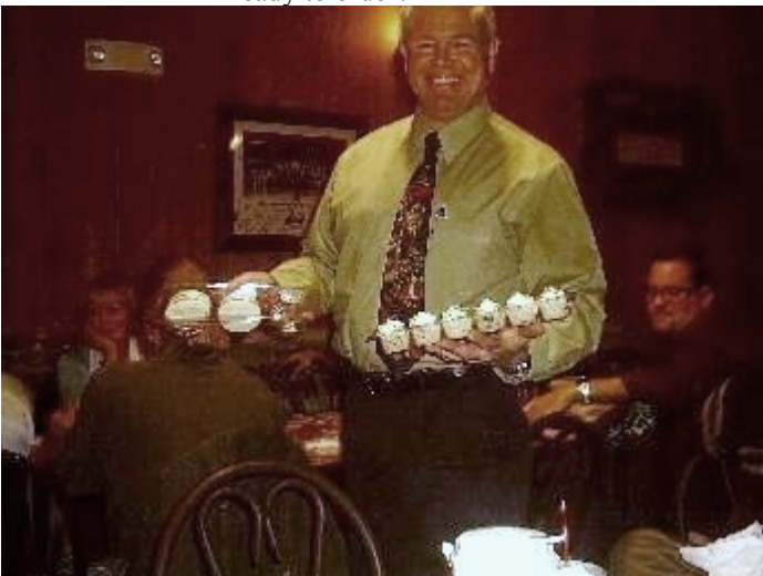
Special treats; special delivery by Fabish