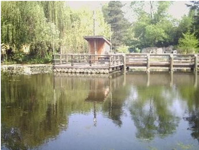
Icky window site

As scheduled, the underwater windows were due for cleaning on May 20. By someone else's schedule, construction was being done just inside our normal entry point at the West gate and there was no getting in. Talking with Joanie (zoo mgr), UrEd received permission to enter through the East gate; it turns out this is a much easier way to get in! A small dirt road goes right up to the plaza where we have been gearing up; now we can drive the equipment in instead of towing those wagons! As it turned out, the weather was great and the window cleaning was in fact enjoyable. Lots of little kids were in the viewing area, and came around to talk after. Best PR!