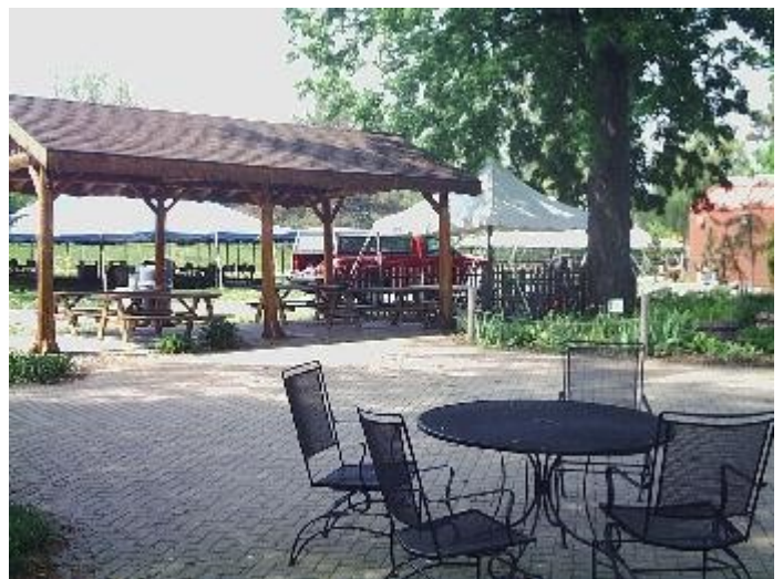
then short walk to staging area!