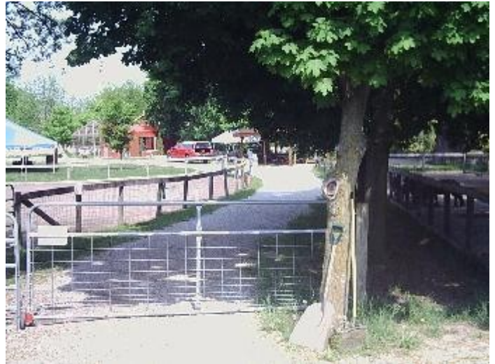
Secondary gate after entering the East gate; drive right in...