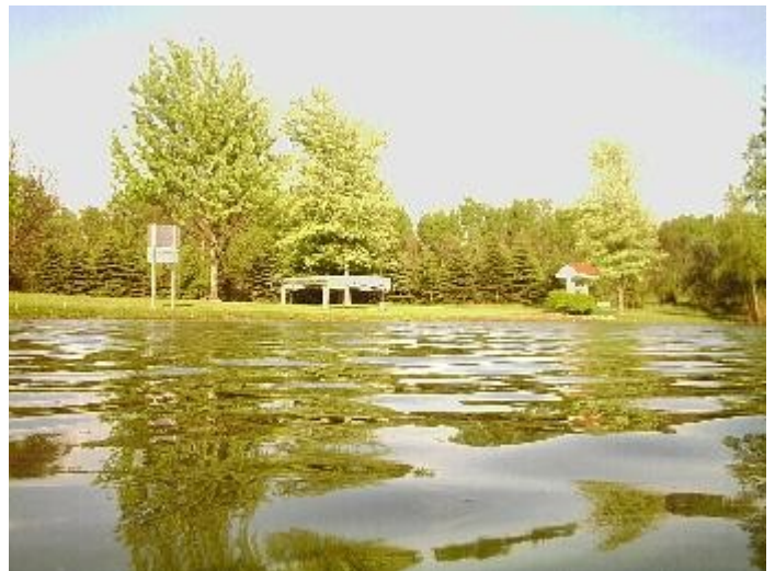
Ben's view of those canoes...