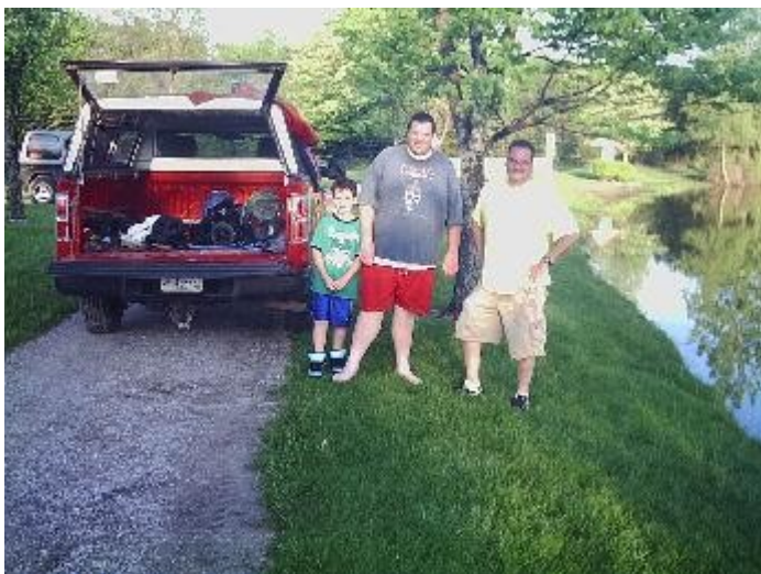
The gang just prior to the park ranger...