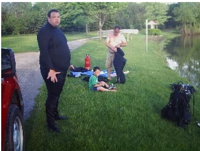
Out of water; dry off and stow gear