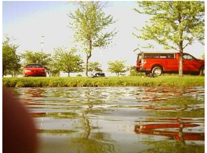
Ben's view of entry point