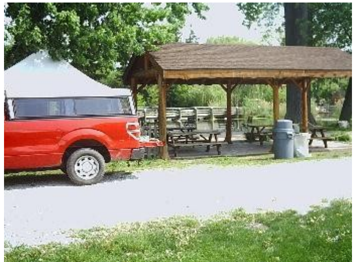
-and park at pavilion,