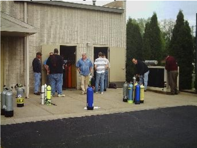
Right door VIP; Left door fill

“What a great night for VIP’s and the members! We were very busy, looking like days of old!