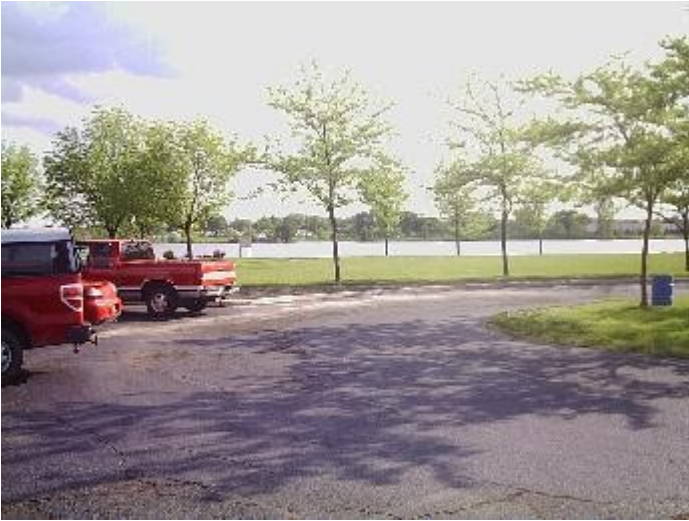
Inviting view of Haithco ; darker clouds back to north

Somebody needs honorable mention for picking the club dive date for May; it was perfect! Sandwiched between rainy conditions, Haithco was calm, (relatively) warm, and sunny. The heavy rains had pushed the water up over the bank; it was probably 1-2 ft deeper.