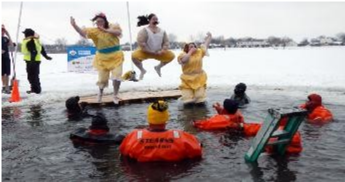
Polar Plunge spirit!