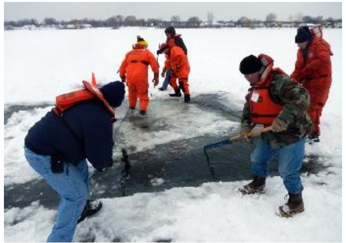
Club members opening the ice hole

An invitation was offered to club members at the February meeting to volunteer to help at the Special Olympics Polar Plunge, held the last week of Feb. At least 10 club members showed up to cut a hole in the ice, and provide safety for about 200 jumpers! Jumpers were sponsored by friends who contributed to the special olympics fund; some were walk-ins that paid the entry fee. Missing are the photos capturing the expressions of the jumpers as they popped to the surface.. .