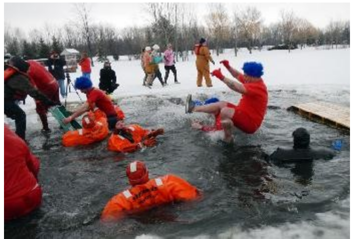
-and assisting the costumed jumpers

Actual jumping was probably over within an hour; afterward the volunteer workers were invited to join the jumpers and organizers for a hot lunch and sincere thanks!