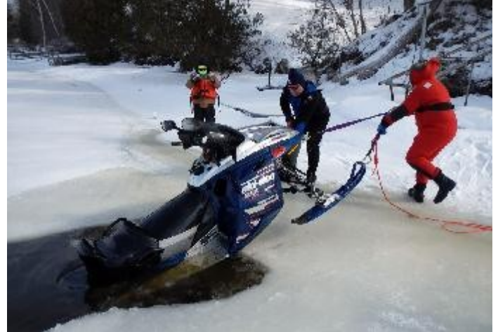
Group hooks another one in Wixom Lake