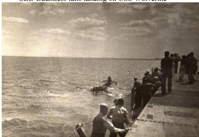
TBM Avenger ditched alongside USS Sable