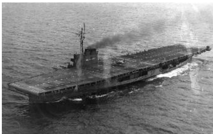
USS Sable in Lake Michigan