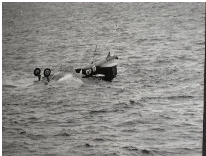
SBD Dauntless fails landing on USS Wolverine