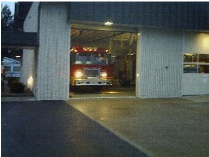
April meeting called on account of fire