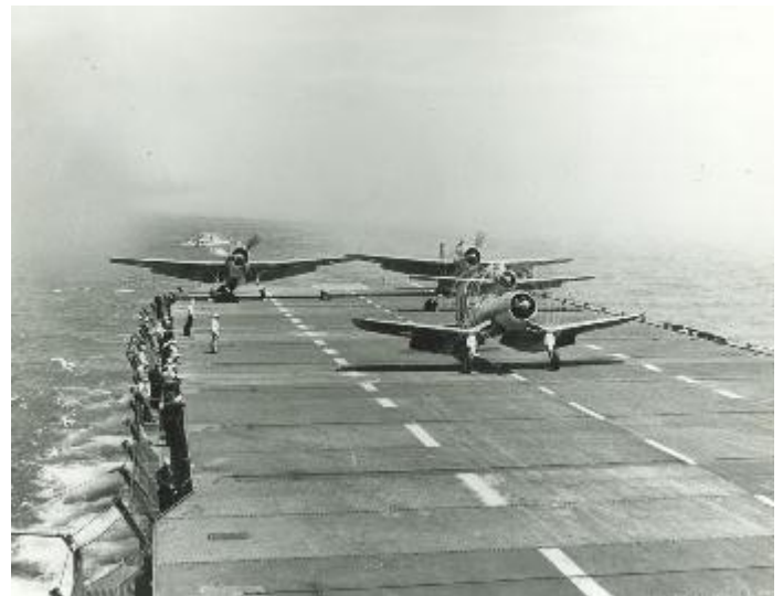
Corsair, Wildcat, 2 Avengers - where?