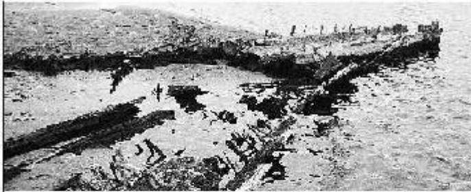
The Aurora, built in 1887, is exposed in the waters off Grand Haven's Harbor Island. Since January, five vessels have been found poking out of water in the area as lake and river levels hit historic lows.