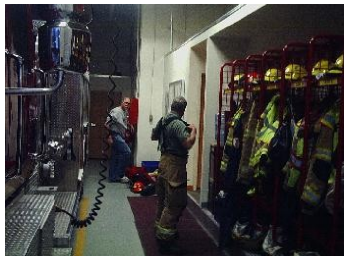
Treasurer and President assuming other identities