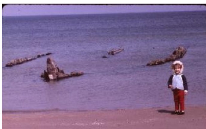
Although a '64 photo, wreck still seen 2.7 miles N of Caseville.

Recent low water levels have been exposing numerous wrecks; including in the Saginaw River. Here's a few others-