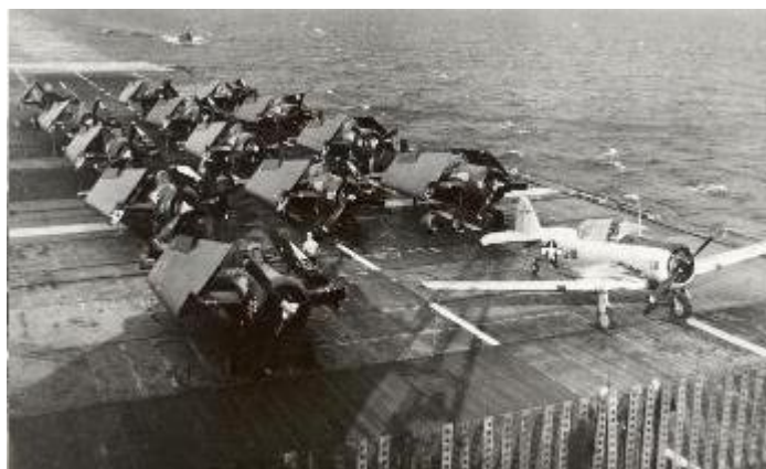
Aircraft tied down on USS Sable