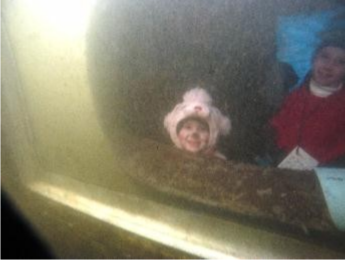
Sisters inside the window watching the carvers