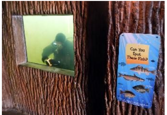
View from inside of M. Fabish polishing the window