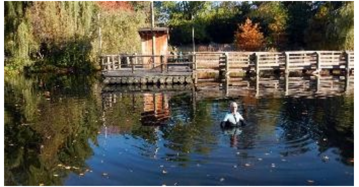
Back to the zoo! Window cleaning time again!