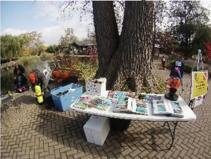
SUE club display table at Children's Zoo

The 2013 pumpkin carving event started out on a cool crisp Sat afternoon at the Children's Zoo. The sun was shining when we got there, but not for long, and continued to play peek-a-boo throughout the rest of the day, with some rain in between. I set up a table and a display to show who we were and talked to the visitors as they stopped by to see what we were doing. As always, there was a lot of interest in our gear, how we carve underwater and diving in general. I put a scuba diving hand signal flyers in the underwater room and we started getting ready. Don Storck had a large collection of DiveTraining magazines available, and I was pleased to see how many kids and adults, wanted to take one to see what diving is all about.