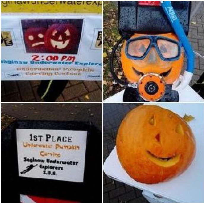
-On Boyle's FB page