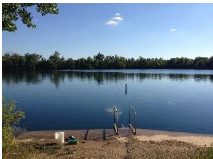
Aug23- 82° Sunny White Star Park, Gibsonburg, Ohio, United States -View from the diving platform. Glorious weather today.