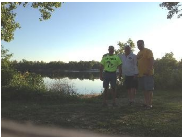
Aug 23- 79° Sunny Shade Rd, Gibsonburg, Ohio, United States The three amigos finishing up a great day of diving. The weather was very nice. We're now on our way back to home base at Portage.