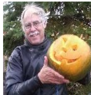
It's UW carving time again!