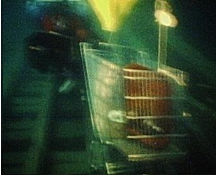
slide capture; wreck raper gathering his finds