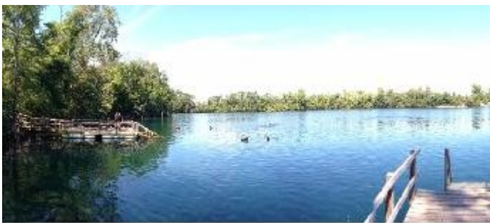
Panoramic view of Gilboa Quarry-