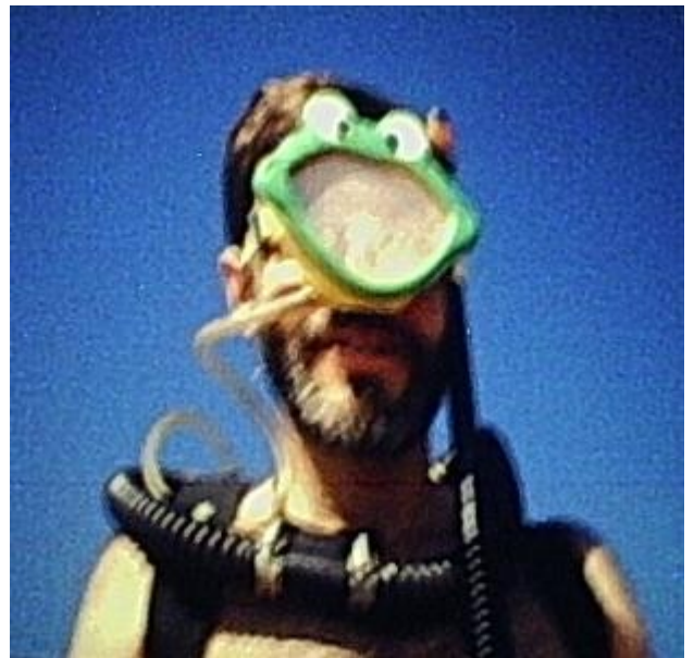
-slide capture; rouges gallery photo of wreck rapist