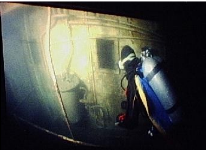
-slide capture; on the Monrovia