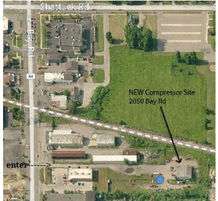
-north on Bay from Weiss; south from Shattuck; turn east (photos by Sommers, who should've been in them also)