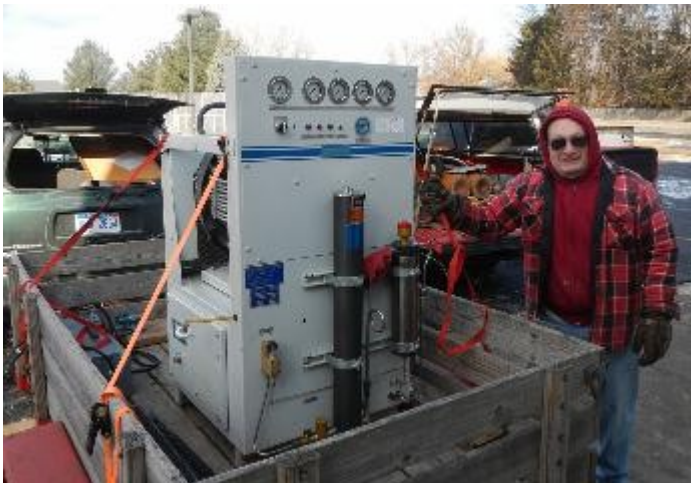
Just have to put your mind to it!