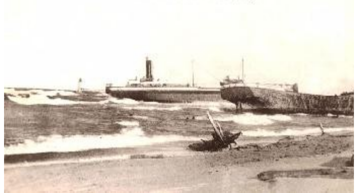
Galetta and Turret Crown Beached by North easter. Grand Marais, Mich. Harbor of Refuge.

Just one of many interesting stories- The Galetta (far right) was thrown on the beach by a storm in Grand Marais, near Munising. Wrecked, the authorities decided to just let it sit there. A year later the steel vessel Turret Crown was blown in and collided with it! The Galetta was later destroyed by a fire.