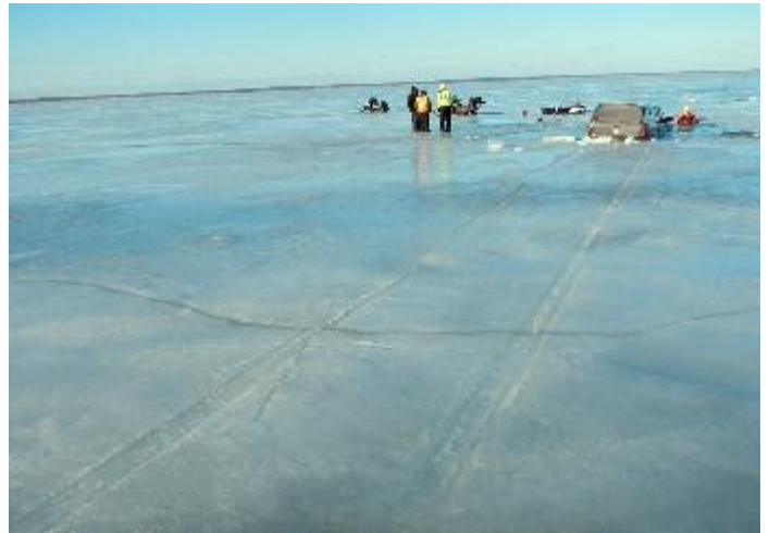
Follow the tracks...