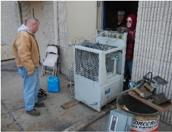
Through the door; now how to lift...