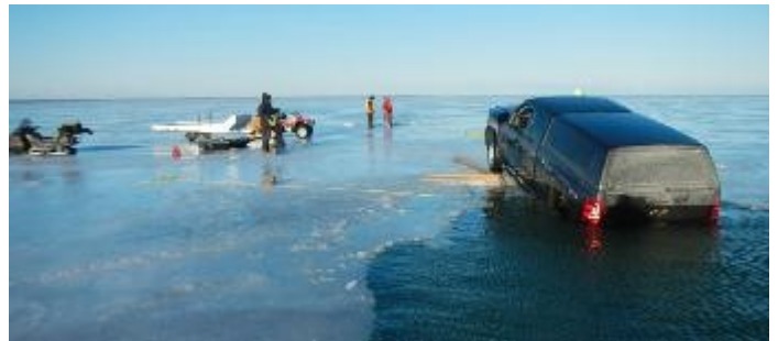
Front of truck first winched up ramps