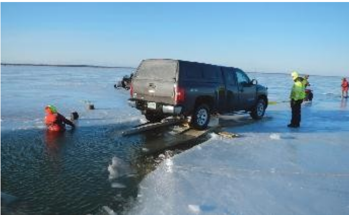
Now home to towel down! (photos and story by Sommers)

There were no reported injuries. The recovery took about 6 hours on the ice by the seven Mike's employees. Mike's used ramps and hand winches to return the truck to solid ice. A snowmobile and quad runner towed the truck back to Palmer Road. The truck was then loaded onto a flatbed tow truck and taken to a heated garage in Saginaw.