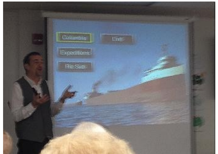
The Fitzgerald in finer days...

Just one of many interesting stories- The Galetta (far right) was thrown on the beach by a storm in Grand Marais, near Munising. Wrecked, the authorities decided to just let it sit there. A year later the steel vessel Turret Crown was blown in and collided with it! The Galetta was later destroyed by a fire.