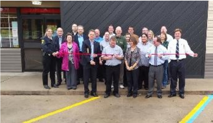
Group of celebrities participating in a ribbon-cutting ceremony in Chesaning.