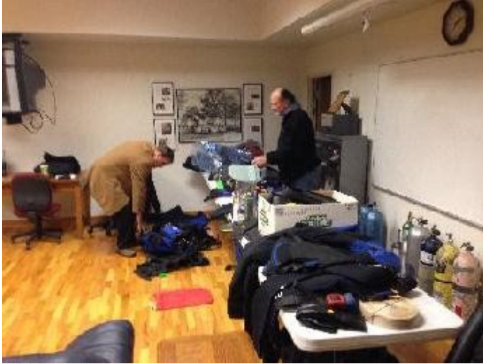
New BC; a steal!