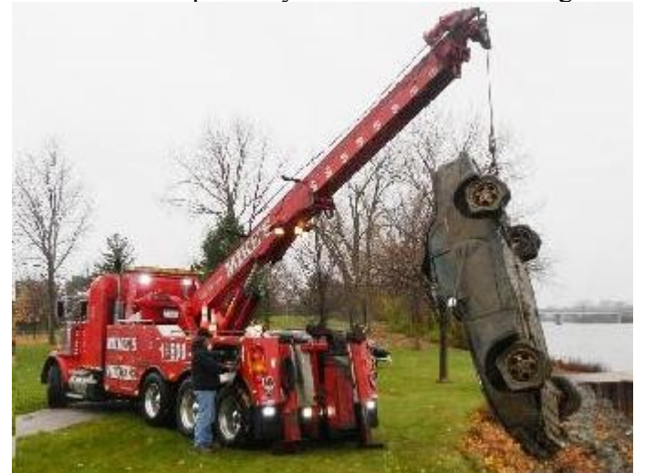
Draining the fish...