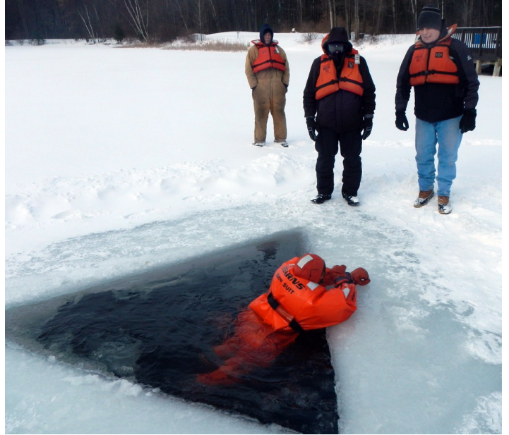
Victim through the ice!