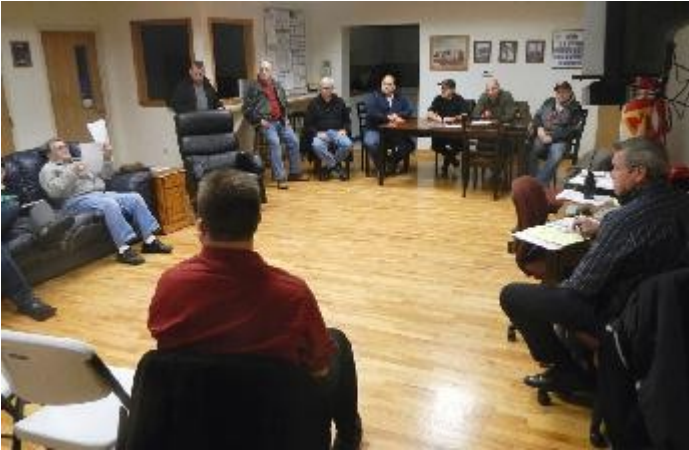
Full House! Good sign for the coming year!