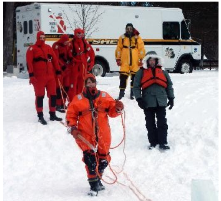
Rescuer with pike pole on the way; secured by rope to rear group