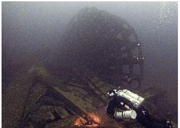
Unk diver examines wreck...

Trotter has released a significant number of photos, but is saving the best material for a speaking tour. As might be expected, the location is a bit vague. One stated "50mi north of Port Austin"; another reported "30mi NE of Harrisville". (appr location)