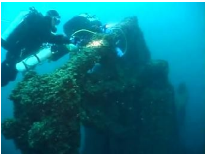
15 mins bottom time...