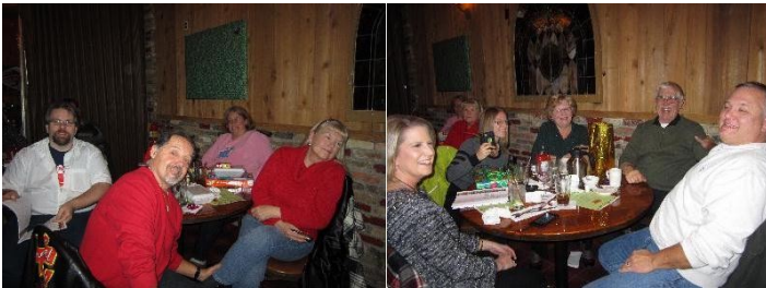
-Collection of season s smiles by Carol Piazza