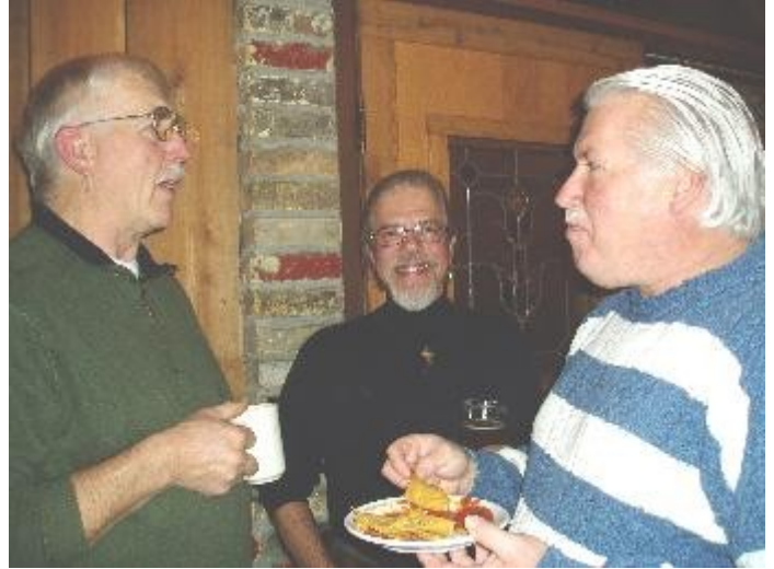
"Did you hear the one about..."

After a settling down period, orders were taken from a selection of items offered by the Timbers. Folks first got serious on their meals; then it was time for the prizes!