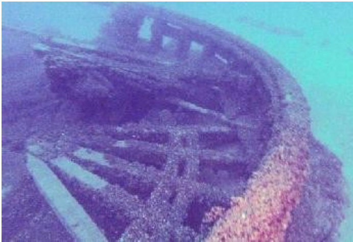
Closer view of side wheel

debris washed up on shore and they realized it had been lost.