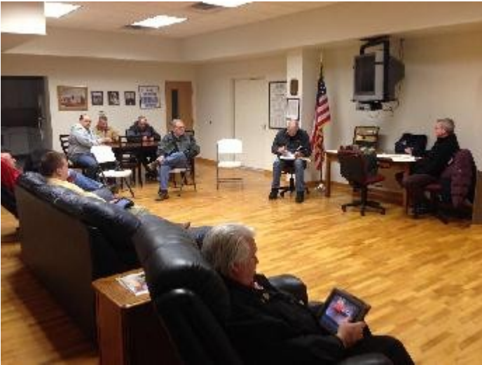
In spite of frigid temps...