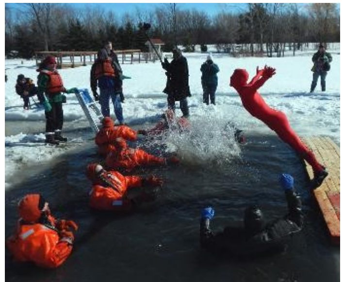
Swan belly-jump during Polar Plunge at Haithco