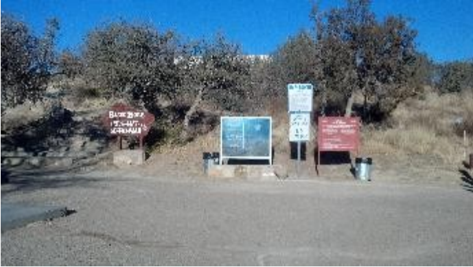
Info Site; Blue Hole

As we made the stop at the Blue Hole in Santa Rosa, I talked with some other divers there. One lady was from Denver doing some check outs with some student she came with. We got our gear on and entered the hole. The water was 64 degrees and clear.