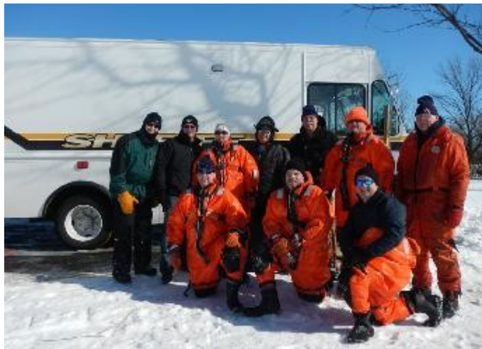
Hole/Safety crew; all SUE members but two.