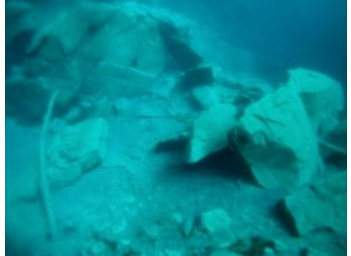
Clear bottom view