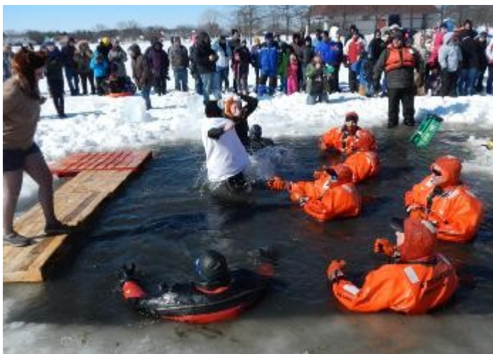
Note observers in back; ice safe enough for all!