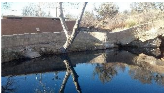
Blue Hole, NM

Enough of ice stories! Greg Prenzler escaped the polar vortex in January by a trip to the Blue Hole in NM. He drove there from Oklahoma with a buddy; it was an all day trip.