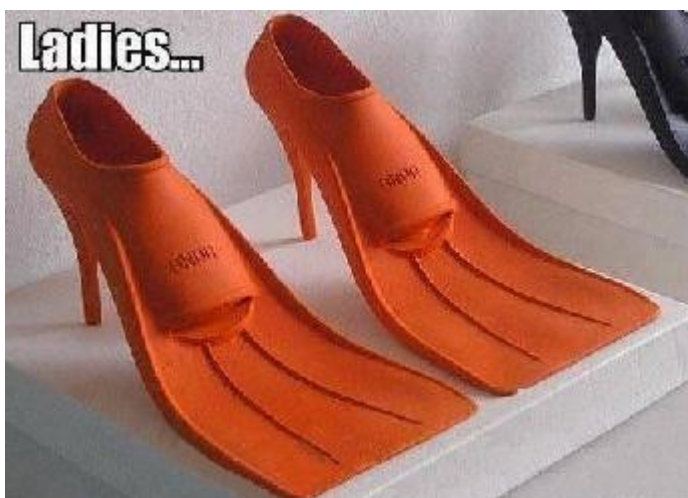
No; do not contact the SCOOP to order yours

For the ladies- Have you heard the saying “there's nothing sexier than a woman in high heels”? Let us be the first to introduce the '14 line of ladies scubawear-