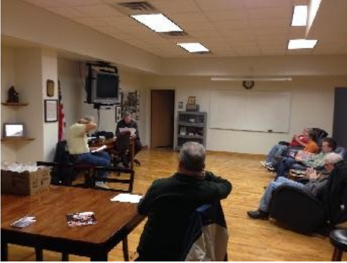
April meeting about to erupt into action