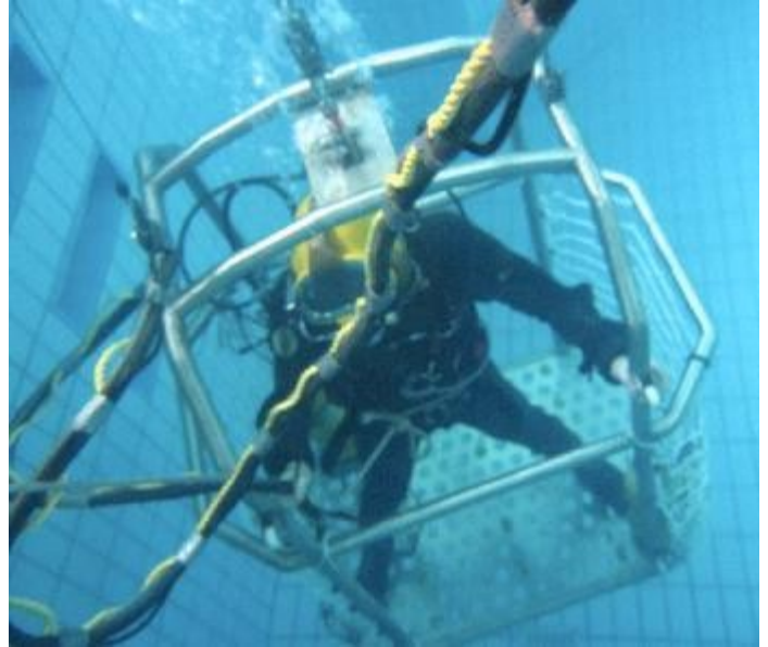
Heading to the bottom...