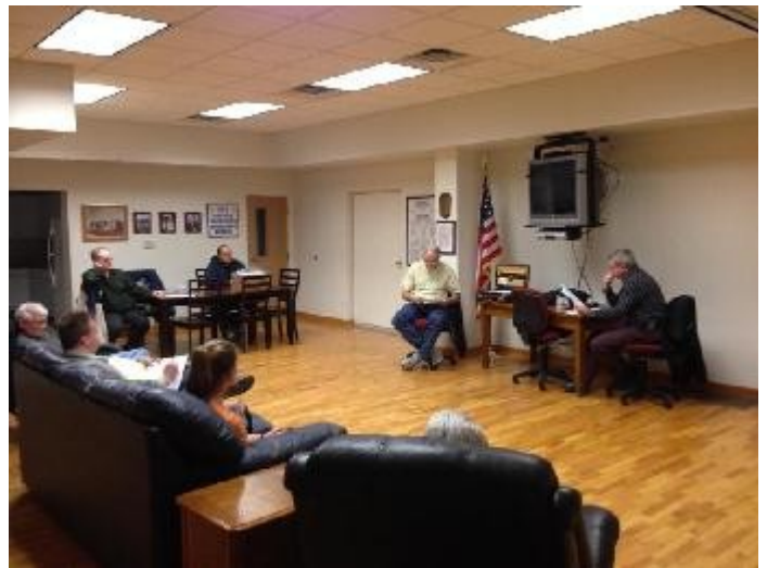
Excited members all trying to talk at once...