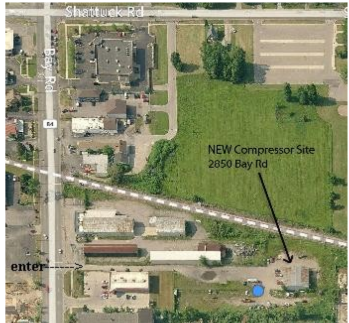
Last chance; Compressor Site...

For Sale/Trade -now accepting 2014 listings