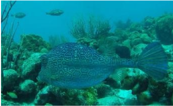
-then this must be the Yellow Grunt?