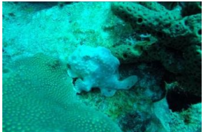
UrEd's 2d guess; White Frog Fish?