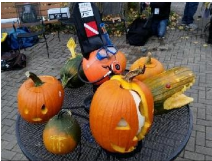
The entries! (The one with the goggles is the trophy)

By 3, the divers were in the water with their pumpkins and switchblades to compete for the top carving honor. They swam with their weighted-down pumpkins to a place in front of the underwater windows viewing area. Hard to measure the size of the viewing audience, but we had their interest! One-by-one, the divers returned to the staging area with their trophies. The top six were placed on a table for judging, and as the zoo visitors walked through they were asked to pick their favorite.