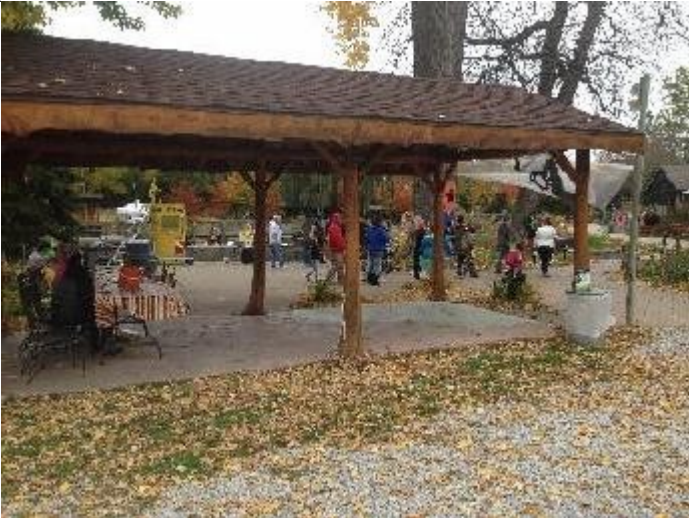
SUE muster area at zoo; note yellow tank, zoo lake in back

The annual SUE October event; the underwater pumpkin carve! Again this year invited back to the Saginaw Children's Zoo! The zoo offers a special day in October for children to celebrate Halloween, called the Zoo Boo. Our artistic pumpkin carving performed in front of the underwater viewing windows (which we clean) has become one of the special attractions. This year we topped our act with the addition of our portable dive tank.