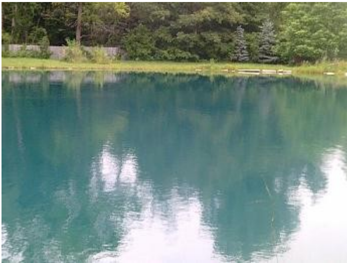
Soaper's Pond; Oct club dive (archive photo)