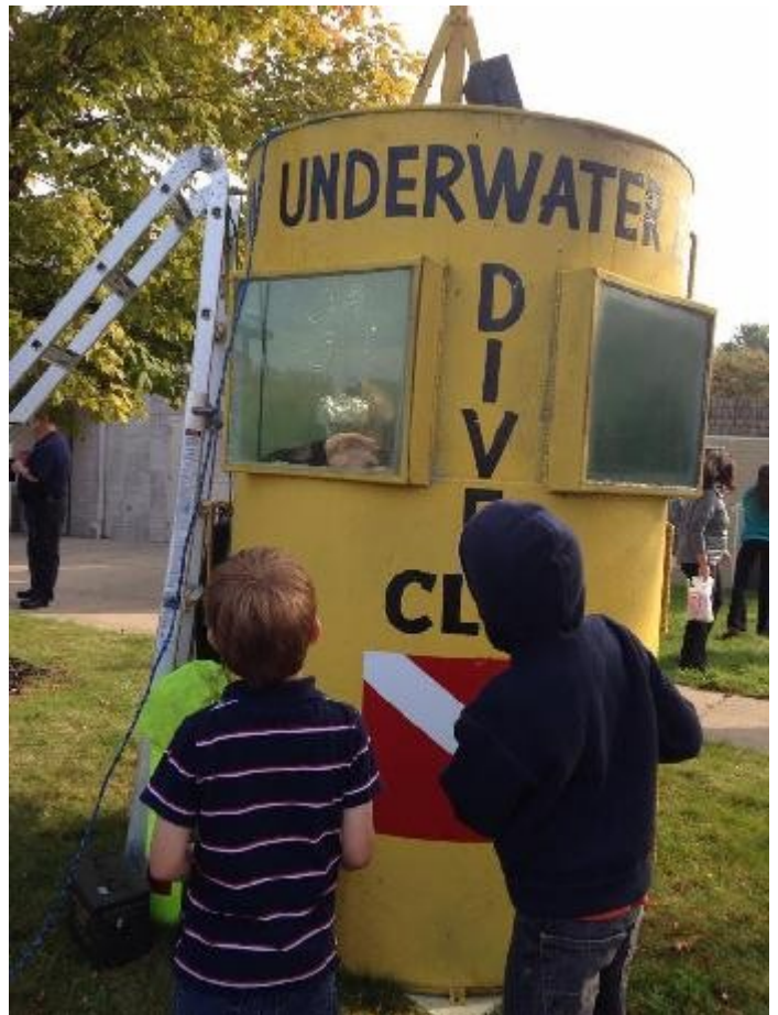
Two curious kids checking out the diver in the SUE tank at the Thomas Twp pancake breakfast.