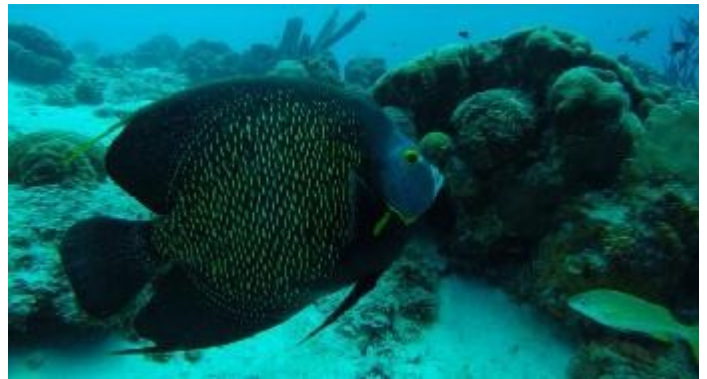
UrEd's guess; the Angel Fish?

“I just wanted to share a pic of a French Angel fish (and some others). The yellow Grunt in the pic was 12- 14 inches in length. Just for comparison the pics were shot with a Go Pro. It needs a red filter, that's why the back ground is all washed out on the white frog fish It's quite rare. I through in a couple extras...” -Rob